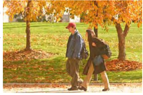
The Cleveland State campus consists of 85 acres with 40 buildings used for teaching, research, housing, administration, and recreation.

The Cleveland State University campus consists of 85 acres — the largest footprint in downtown Cleveland — with 40 buildings