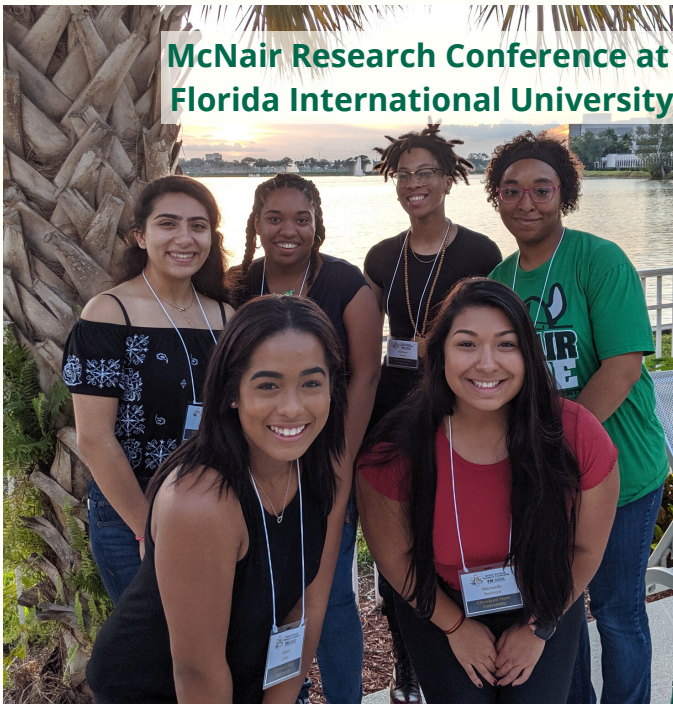
McNair Research Conference at Florida International University