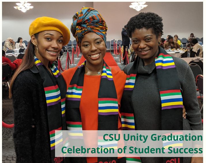
CSU Unity Graduation Celebration of Student Success