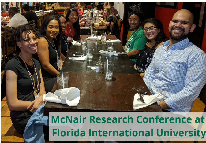
McNair Research Conference at Florida International University