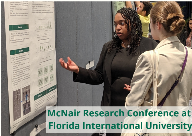
McNair Research Conference at Florida International University