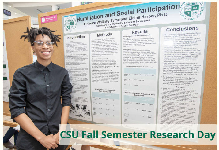
CSU Fall Semester Research Day