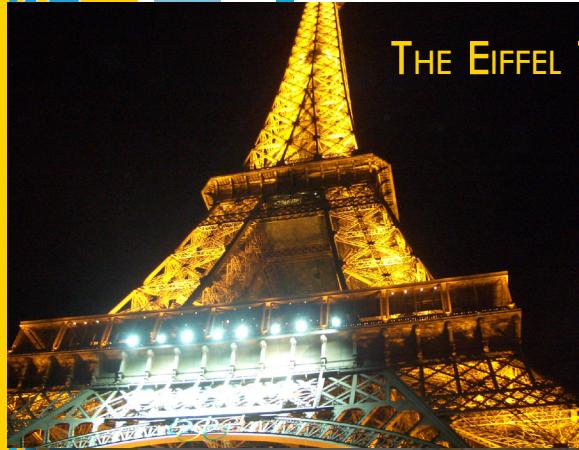
THE EIFFEL TOWER

Our exploration of Paris will include a boat tour on the Seine, and visits to famous museums and sites such as the Eiffel Tower, the Louvre, and the Orsay museum.