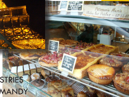
FRENCH PASTRIES FROM NORMANDY