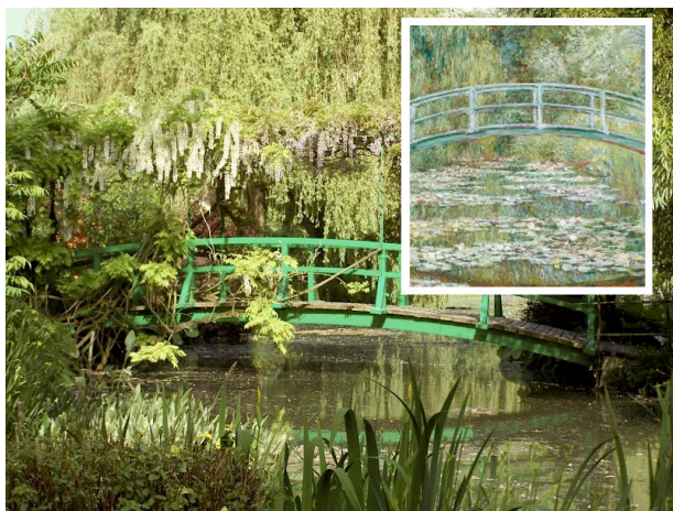
Water Lily Gardens of Giverny, which inspired Monet's Waterlily series of paintings