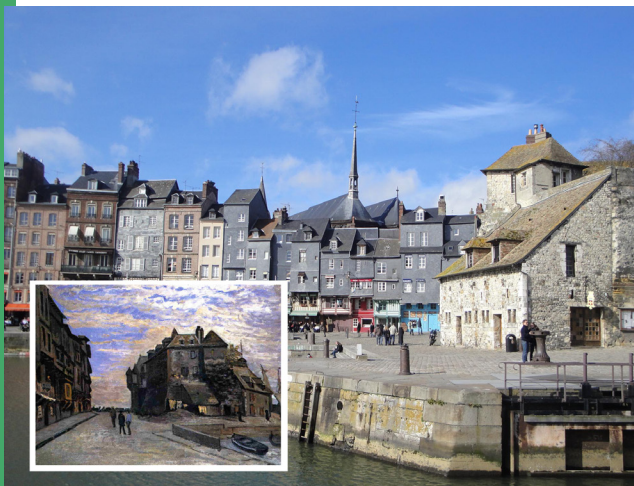
The seaside town of Honfleur, another inspiration for Monet and other impressionist painters