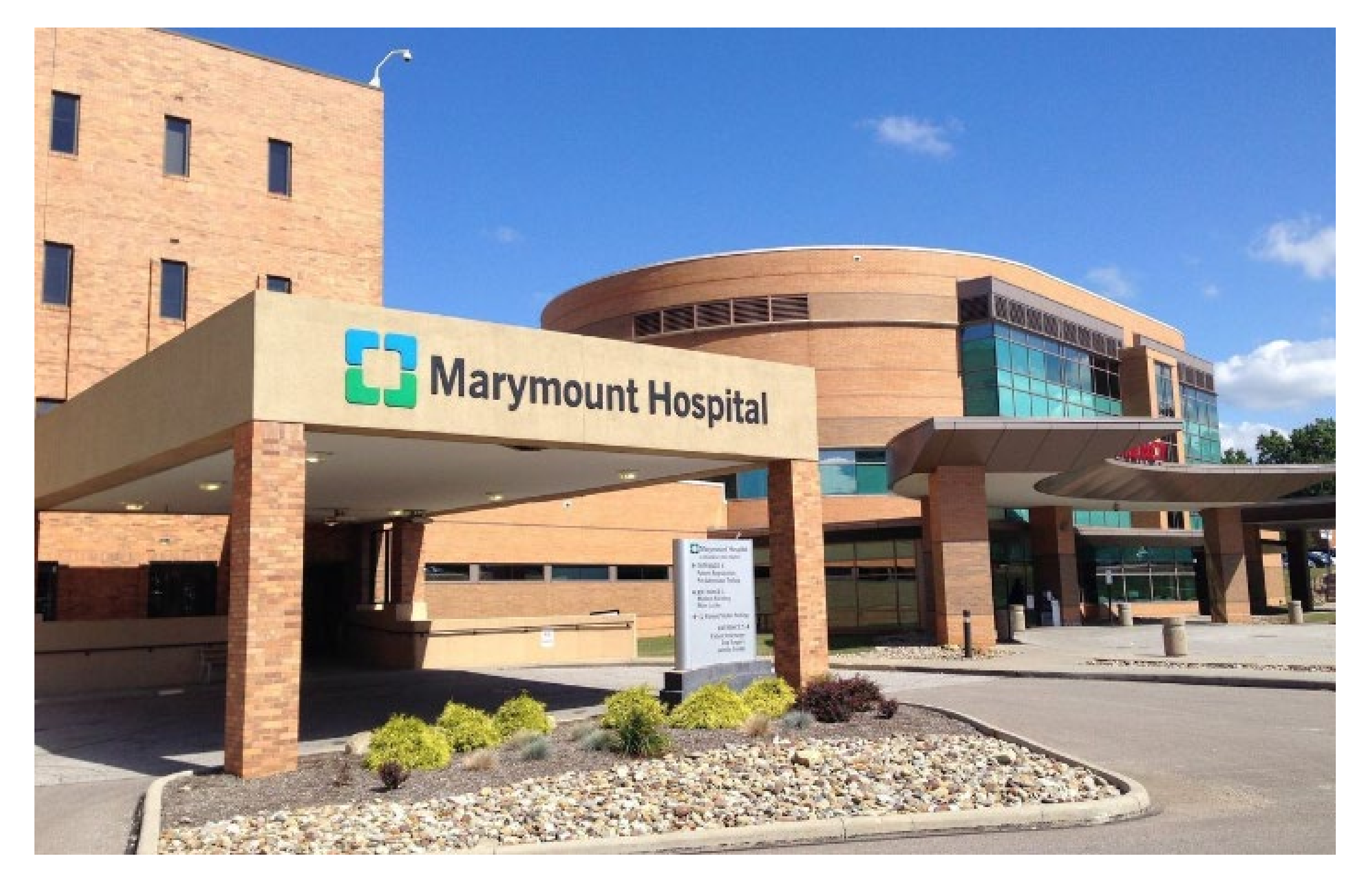
Figure 3. Marymount Hospital