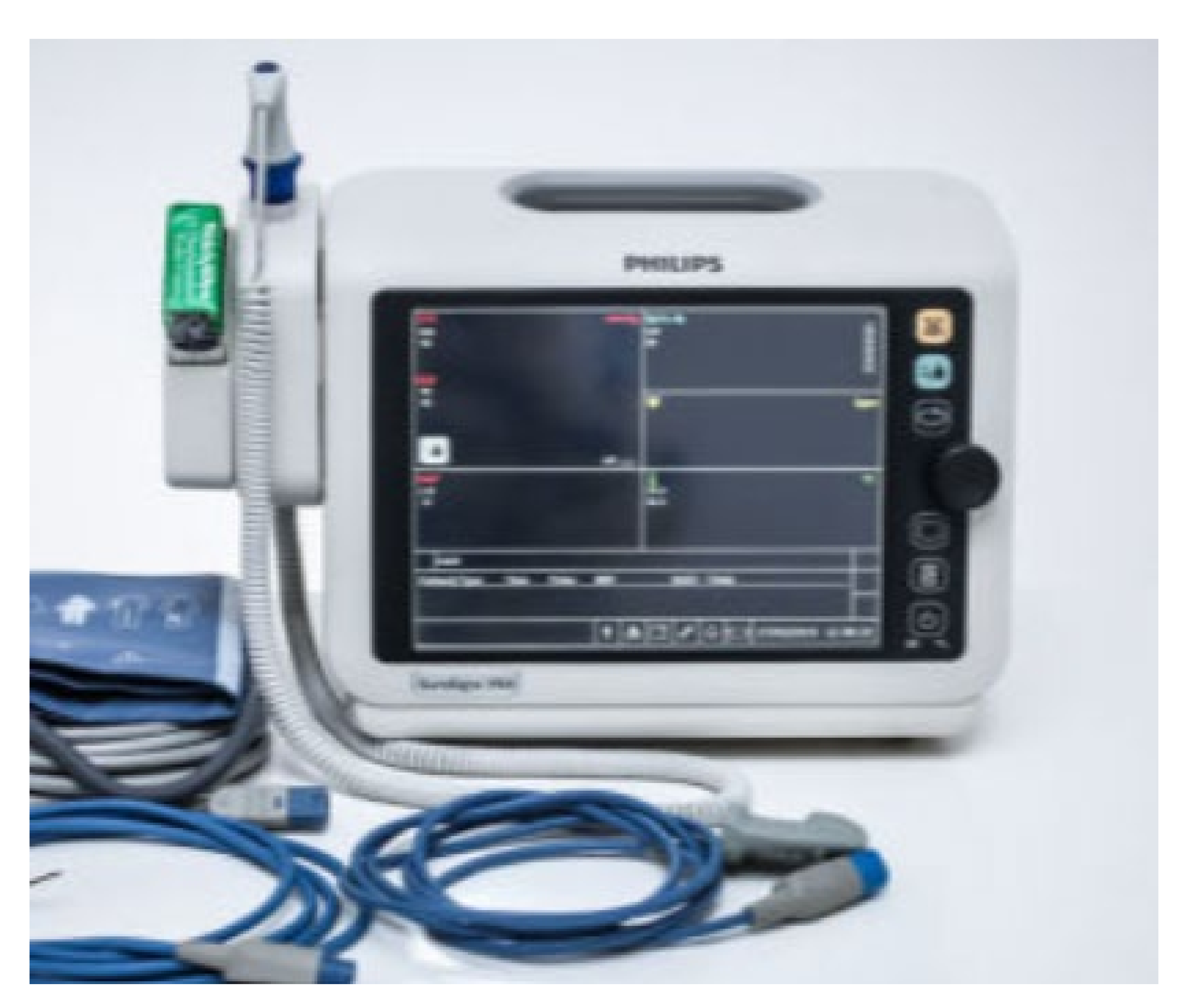
Figure 2. Vital Sign Monitor