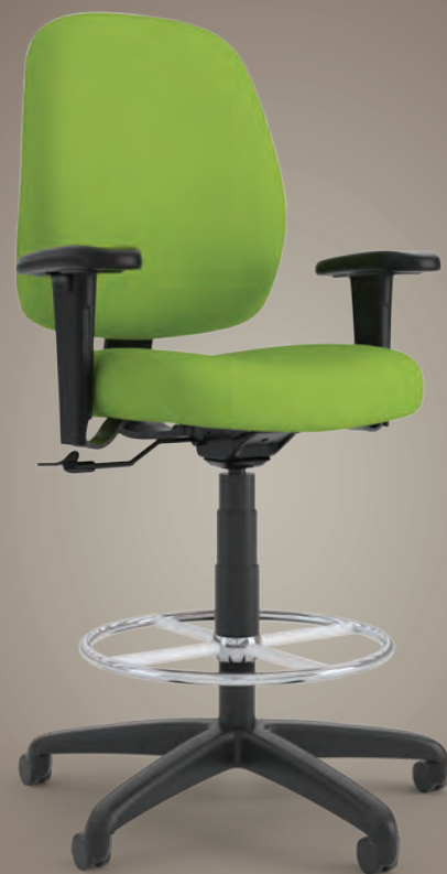
UPHOLSTERY: Messenger Neon by Maharam // Adjustable Arms // BASE: Black