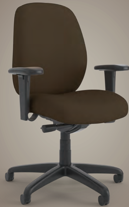
UPHOLSTERY: Medium Espresso by Maharam // Adjustable Arms // BASE: Black