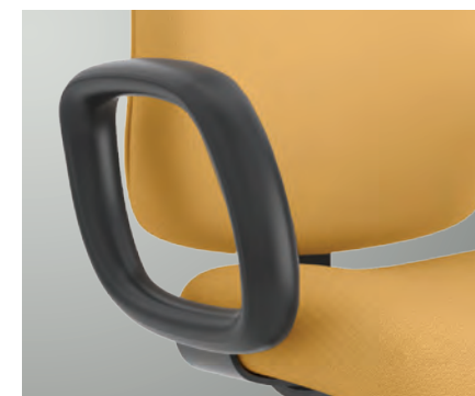
Task Fixed Arm