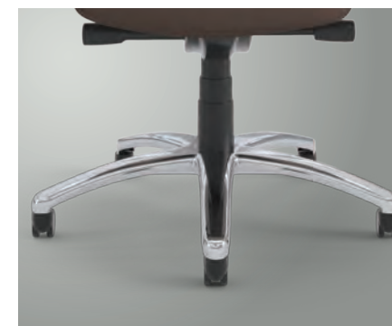
Brushed Aluminum Base