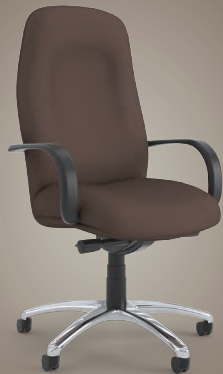
UPHOLSTERY: Messenger Coffee by Maharam // Fixed Arms // BASE: Aluminum