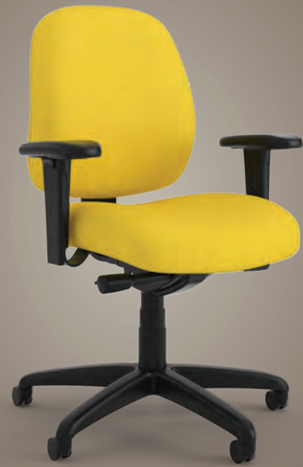
UPHOLSTERY: Medium Prospect by Maharam // Adjustable Arms // BASE: Black