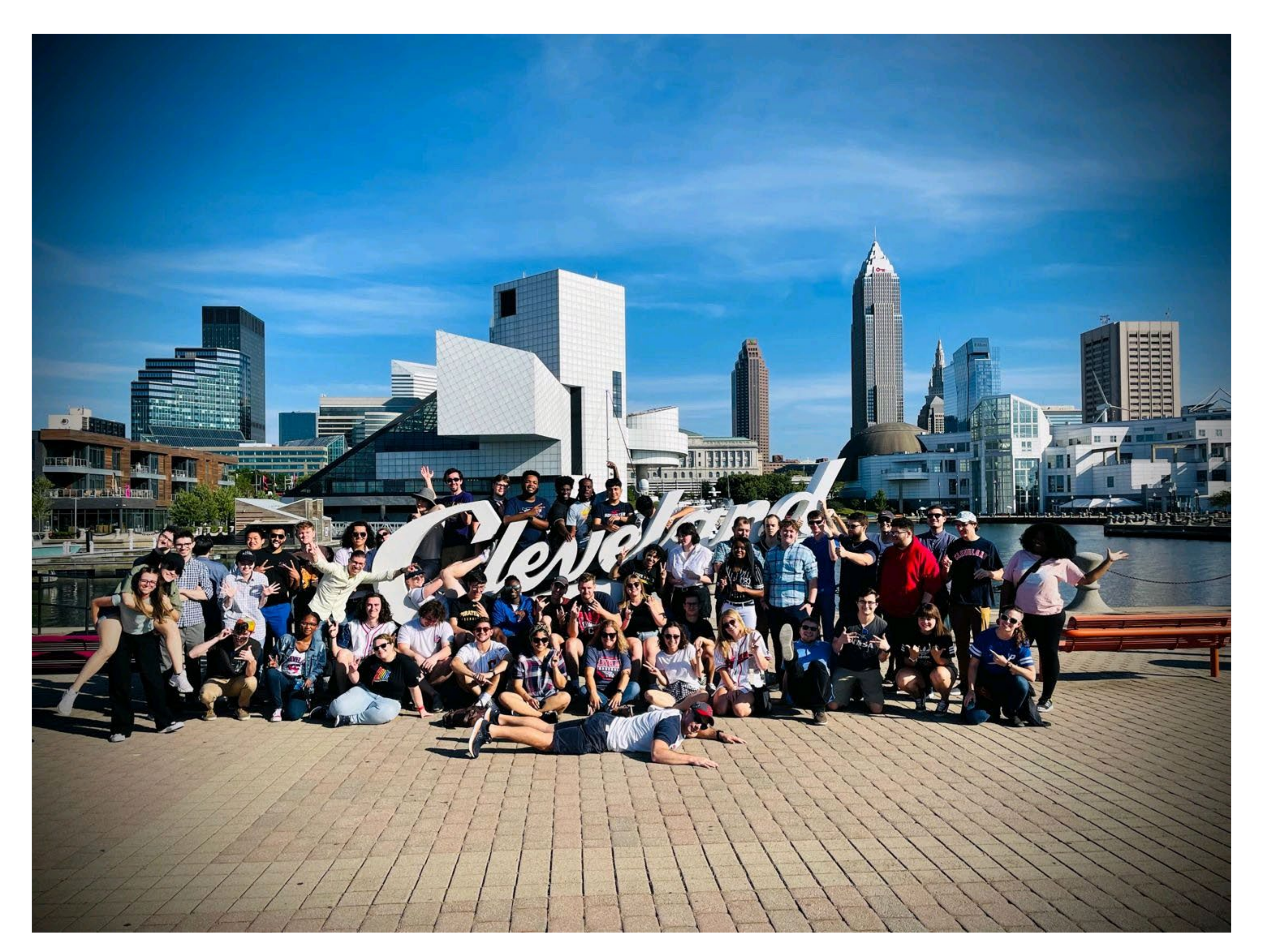
Figure 3. Progressive Summer 2022 Interns took a trip to Cleveland to attend a Guardians game at Progressive Field