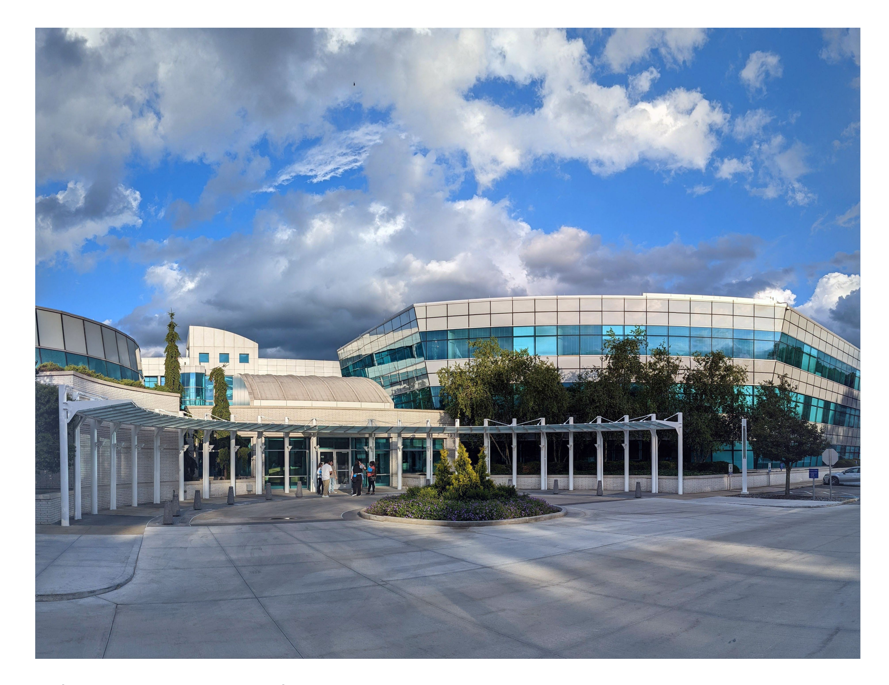
Figure 2. Progressive Insurance Campus.