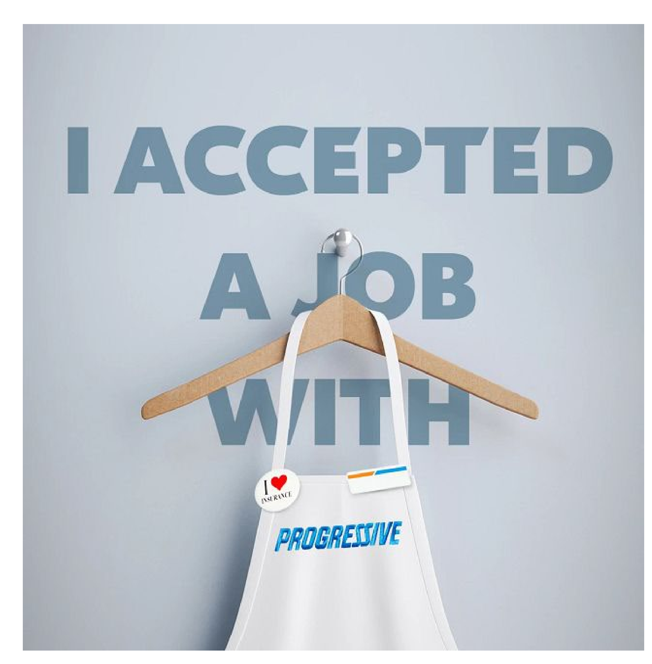
Figure 4. An Acceptance to a Full-Time Position.

Overall, my internship at Progressive Insurance provided me with valuable experience and skills that will serve me well in my future career. I gained a deeper understanding of IT operations, especially within industry. The skills I learned at CSU, allowed me to succeed in a fast-paced environment. During my time at Progressive about many new tools and tech concepts that will assist me in my future career like automation and virtualization and showed an inside look at my future career. I am excited to continue using these skills in my career.