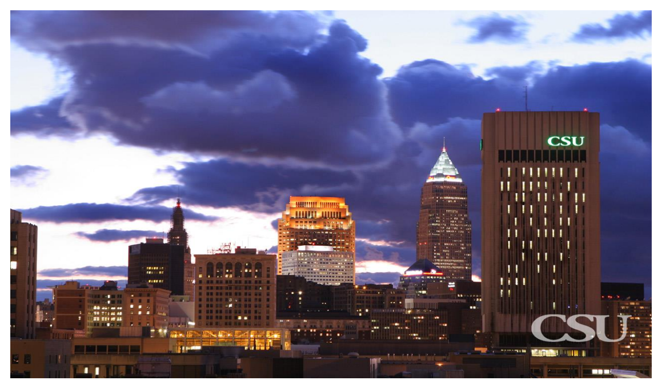
A Guide for Faculty, Staff, Students, and Visitors