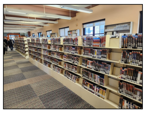
This photo shows part of the Foreign Language Department holdings. Consisting of some 450,000 items, the collection, which is the largest in the region, serves the needs of the large ethnic community of the Cleveland area.

On the fourth floor of the Main Building, the group visited the Foreign Literature Department, which holds one of the largest collections of its kind in the nation. It serves the ethnic community of Cleveland and the surrounding area. Fiction and non-fiction books, periodicals, language-training recordings, and other materials are available in more than forty-five languages.