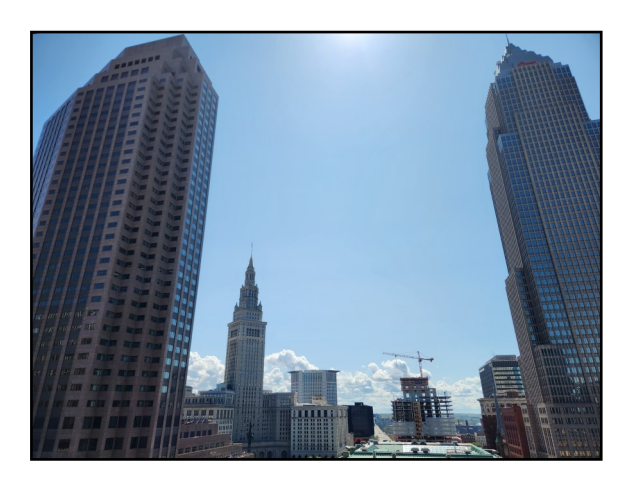
This is the view toward Public Square from the Stokes Wing balcony.

The group made a visit to the balcony on the 10<sup>th</sup> floor of the Stokes Building, where there are magnificent views of Downtown Cleveland.