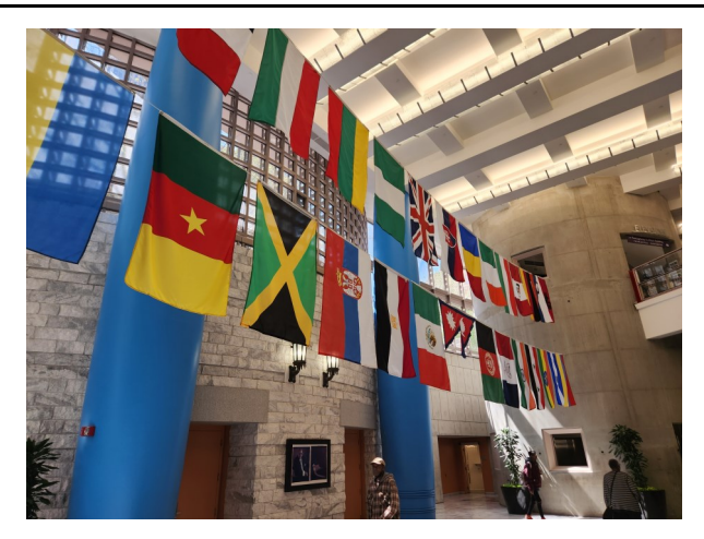
The lobby of the Stokes Building features a display of flags from around the world.

The group made a visit to the balcony on the 10<sup>th</sup> floor of the Stokes Building, where there are magnificent views of Downtown Cleveland.