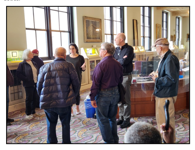
Members of the CSU Retirees Association and their guest listen to an explanation of the mission and operations of the Ohio Center for the Book.

Our next stop was the Ohio Center for the Book, which is part of a national program initiated by the Library of Congress in 1977 to "highlight each state's literary heritage." Located on the Main Building's second floor, the Center was moved from its original home at the State Library of Ohio in Columbus to the CPL in 2003. According to the CPL's website, the Center "maintains a growing circulating collection of fiction and non-fiction books written by Ohio authors." Because Ohio is the "birthplace" of Superman and the state has been the home to other notable creators of comic books, the Center "adopts as one of its primary charges the promotion and advocacy of comics as an important and unique medium of expression."