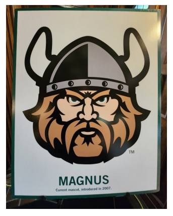
Magnus is the current mascot for CSU sports teams.