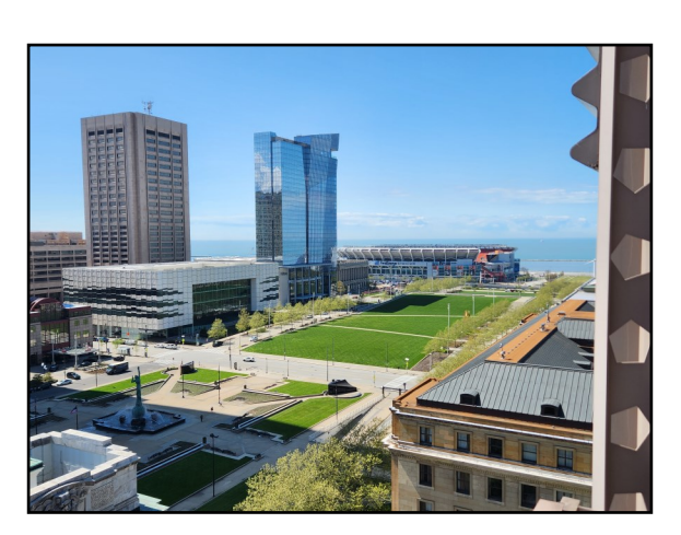
This is the view toward Lake Erie from the Stokes Wing balcony.

A section of the Stokes Wing resembles a silo, and its stairwell serves as part of the fire escape system (note the spiral stairs in the photo below). The blue pendulum-shaped structure in the middle contains ventilation ductwork.