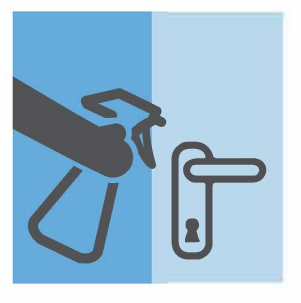
CLEAN AND DISINFECT "HIGH-TOUCH" SURFACES OFTEN