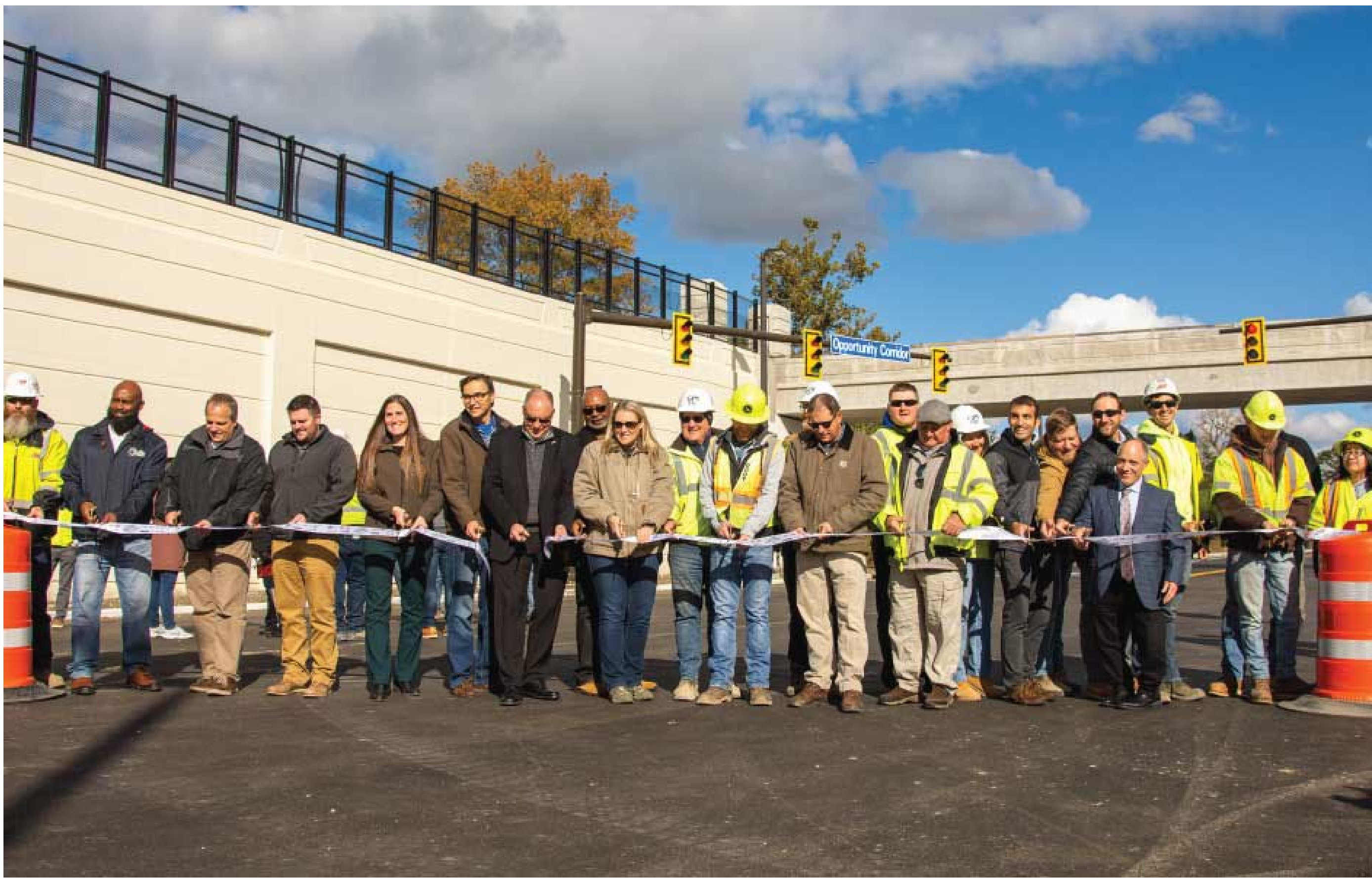
Cleveland Opportunity Corridor Open