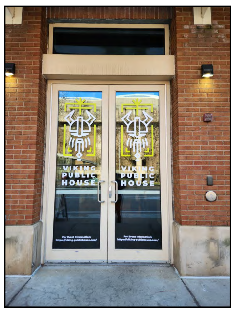
The Viking Public House is in the renovated and expanded space formerly occupied by Elements Restaurant.