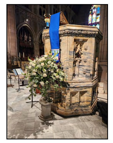
The pulpit at Trinity Cathedral