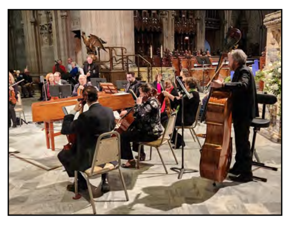
The Trinity Chamber Orchestra had 18 members for the Messiah Sing.