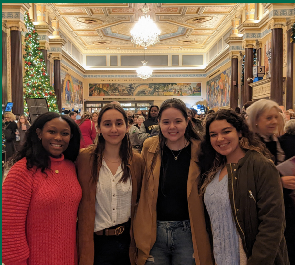
Scholars attending Hamilton