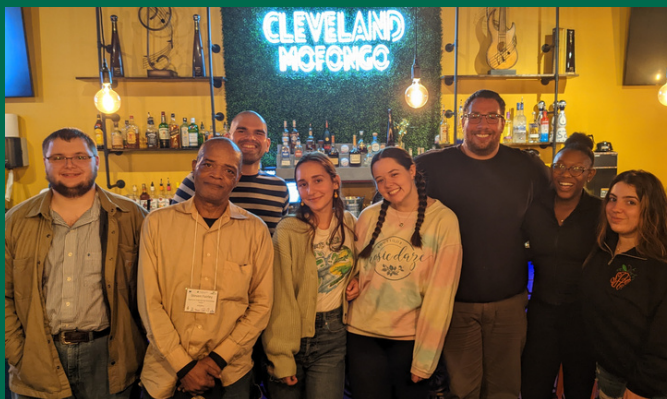
Scholars at a Puerto Rican Restaurant