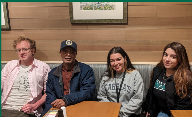
Scholars at Pittsburgh school visit