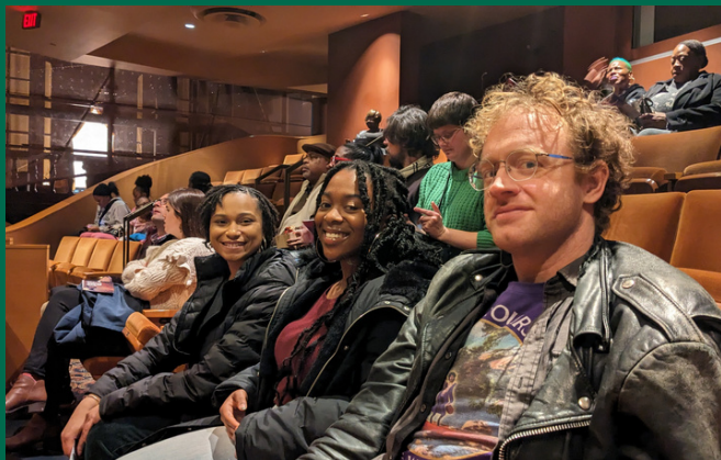
Scholars attending Black Nativity