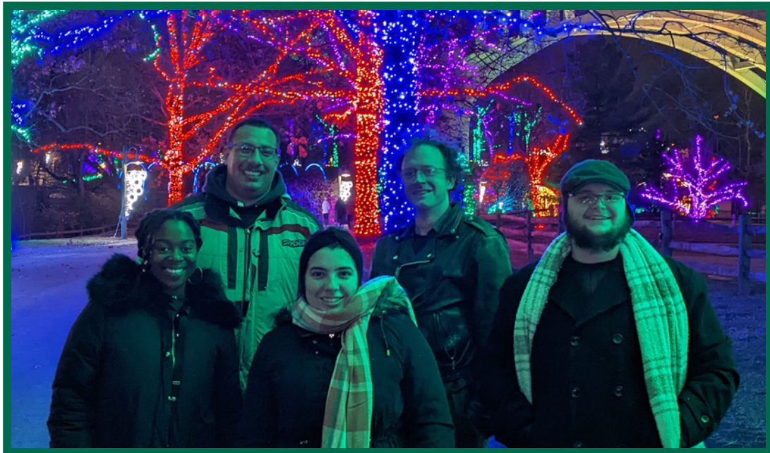
Scholars visiting the lights at the Zoo