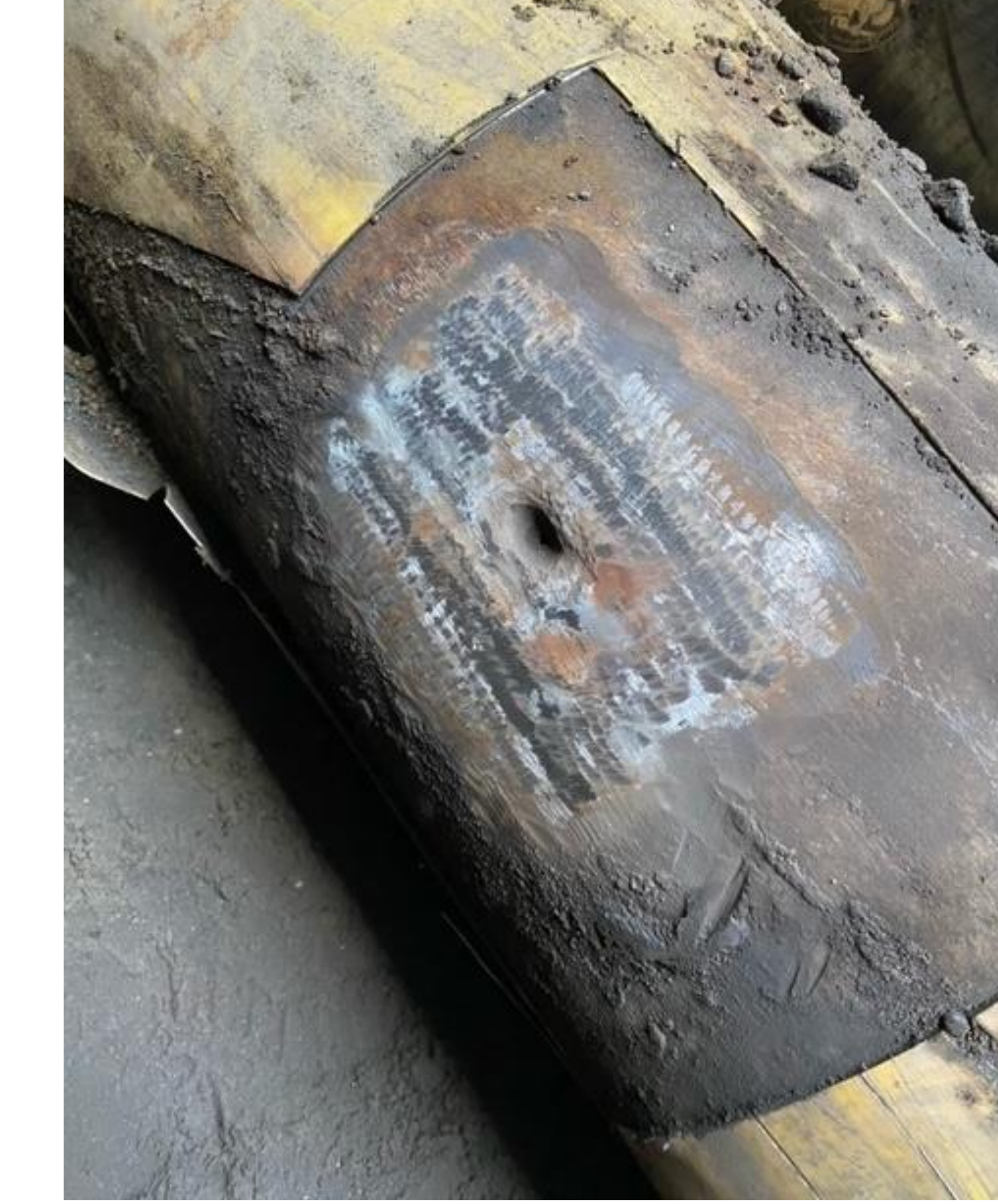
Figure 4. The hole in the pipe responsible for the leak

Internal technicians were initially used to find the leak in visible areas of the chilled water system; this was not useful in finding it. A leak detection company would be called out to investigate other possible locations that would end up being red herrings. The location of the leak would be discovered when mephitic steam started spewing from a manhole cover, upon further inspection by Cleveland Thermal the fumes were the mistakable smell of chilled water flashing off; the chilled water line was found to be leaking onto the nearby steam vault.