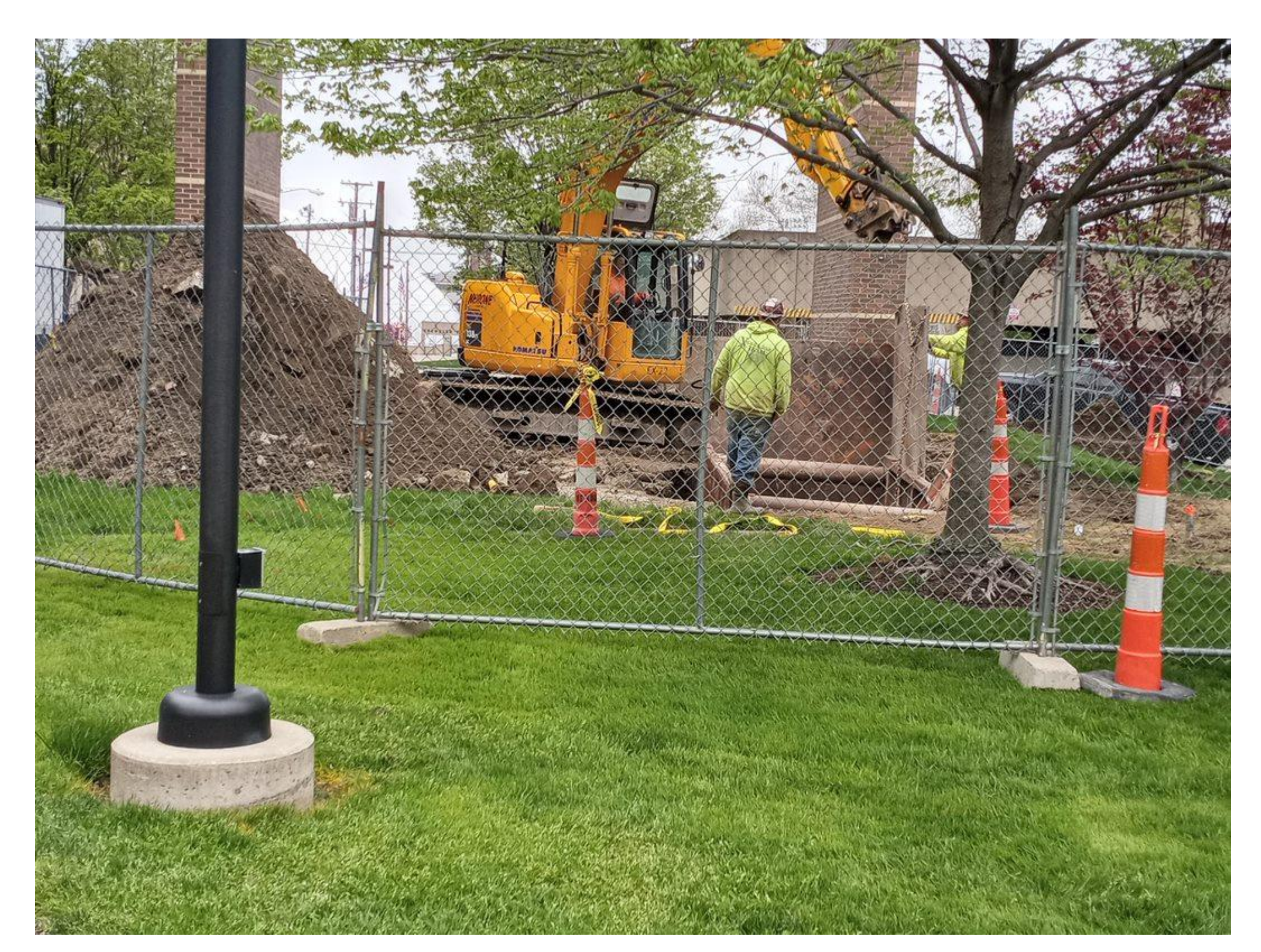
Figure 1. The location between the Law and Music Buildings being investigated.