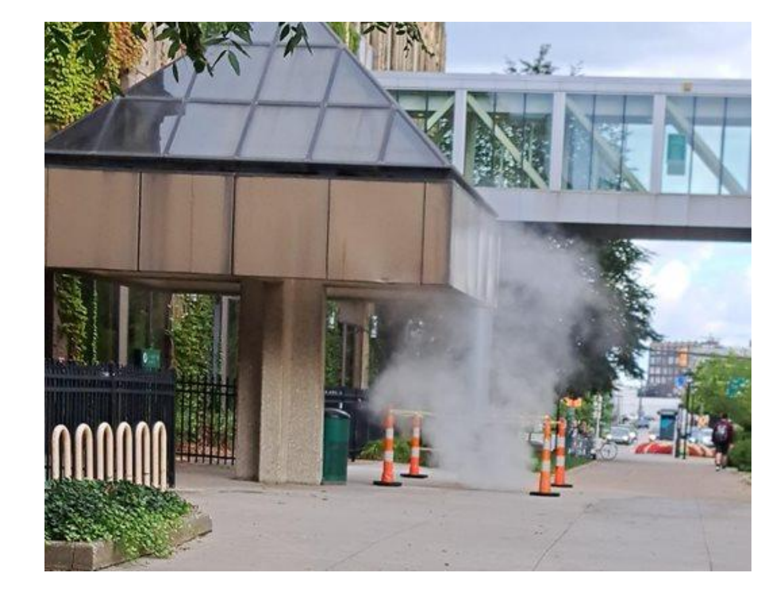
Figure 2. Steam spewing out of the manhole cover on E24th