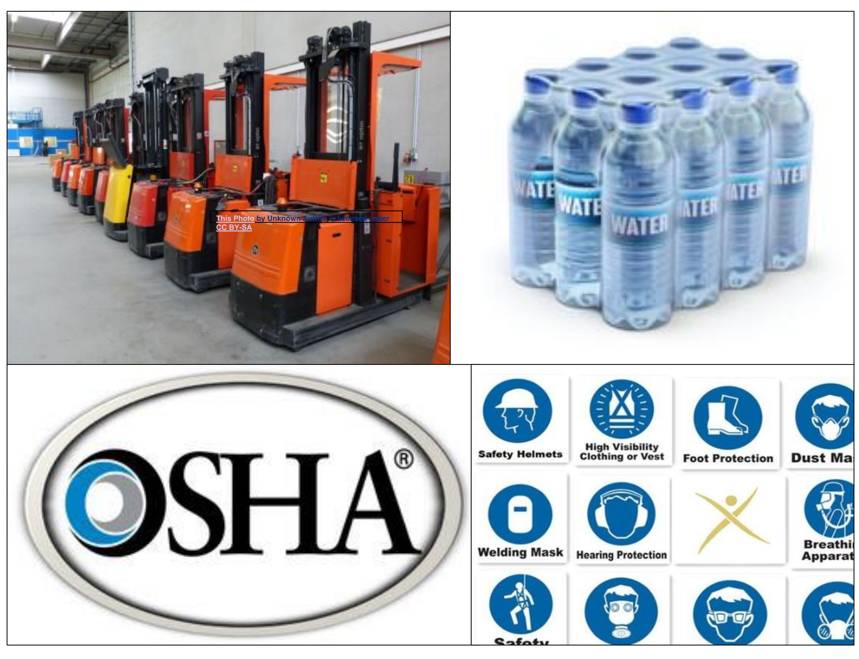
Figure 4. Main Responsibilities