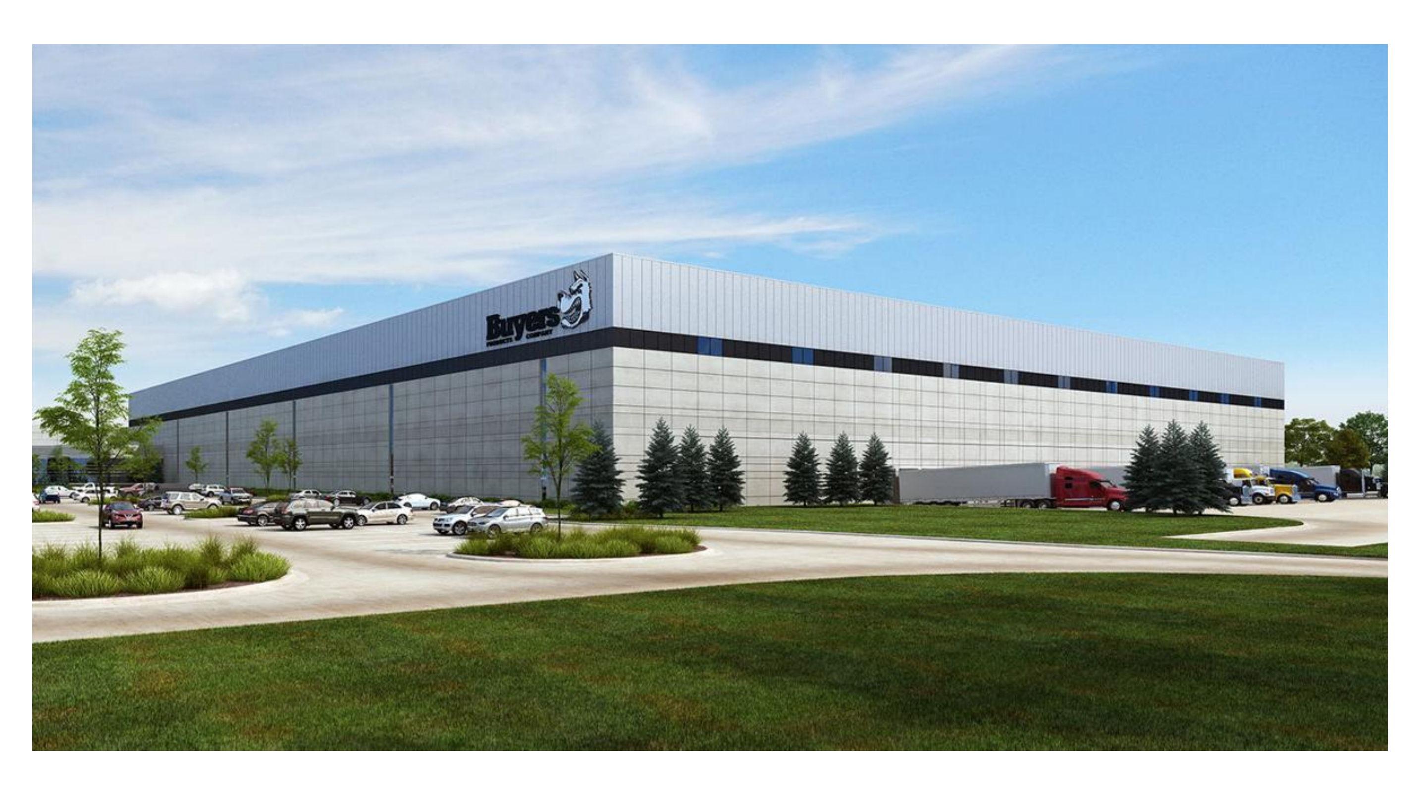
Figure 1. Buyers Warehouse

Buyers Products Company is a manufacturing company that designs and makes truck equipment such as snowplows and salt spreaders for use on road maintenance vehicles.