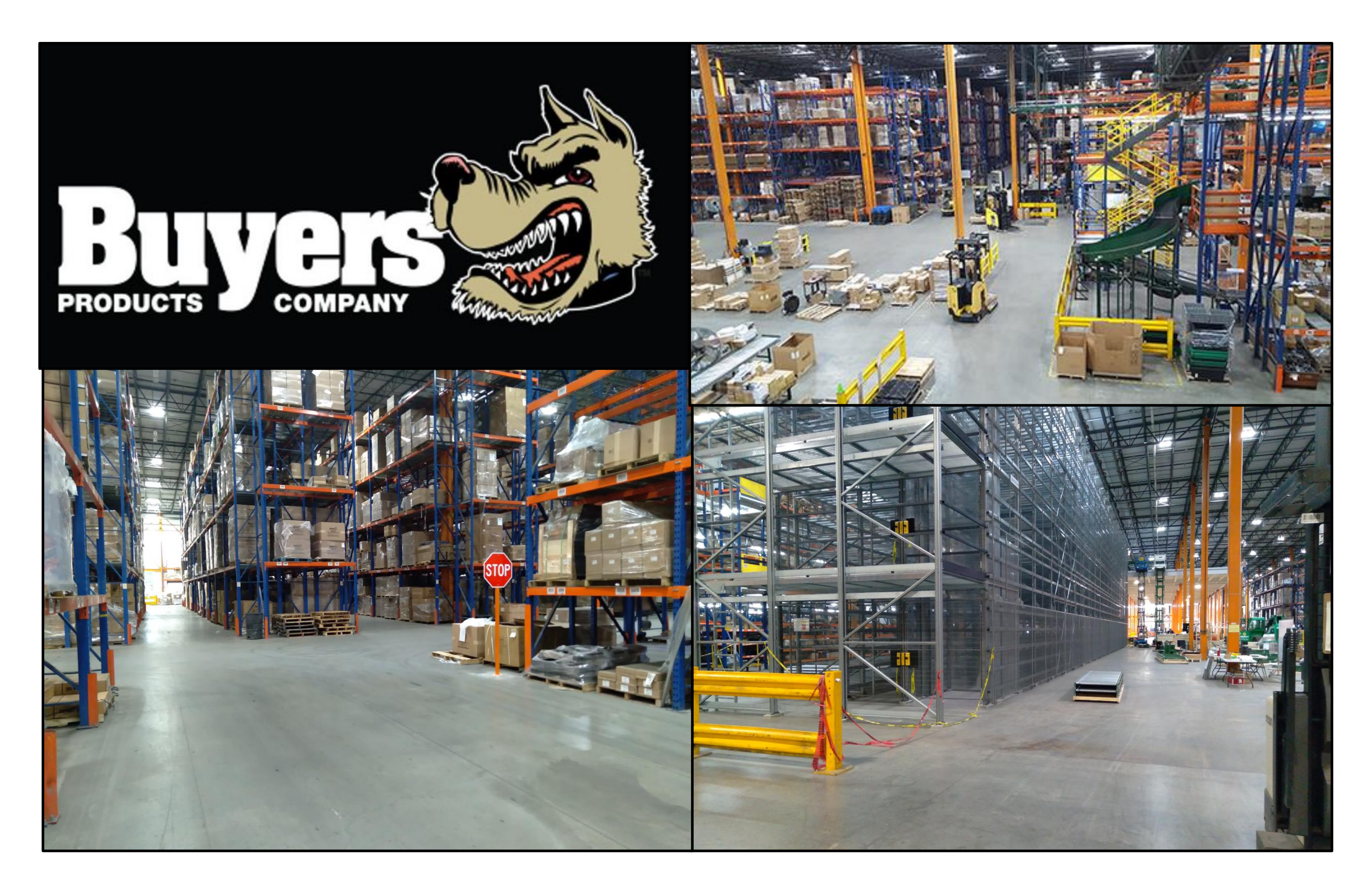
Figure 2. Inside Buyers Warehouse