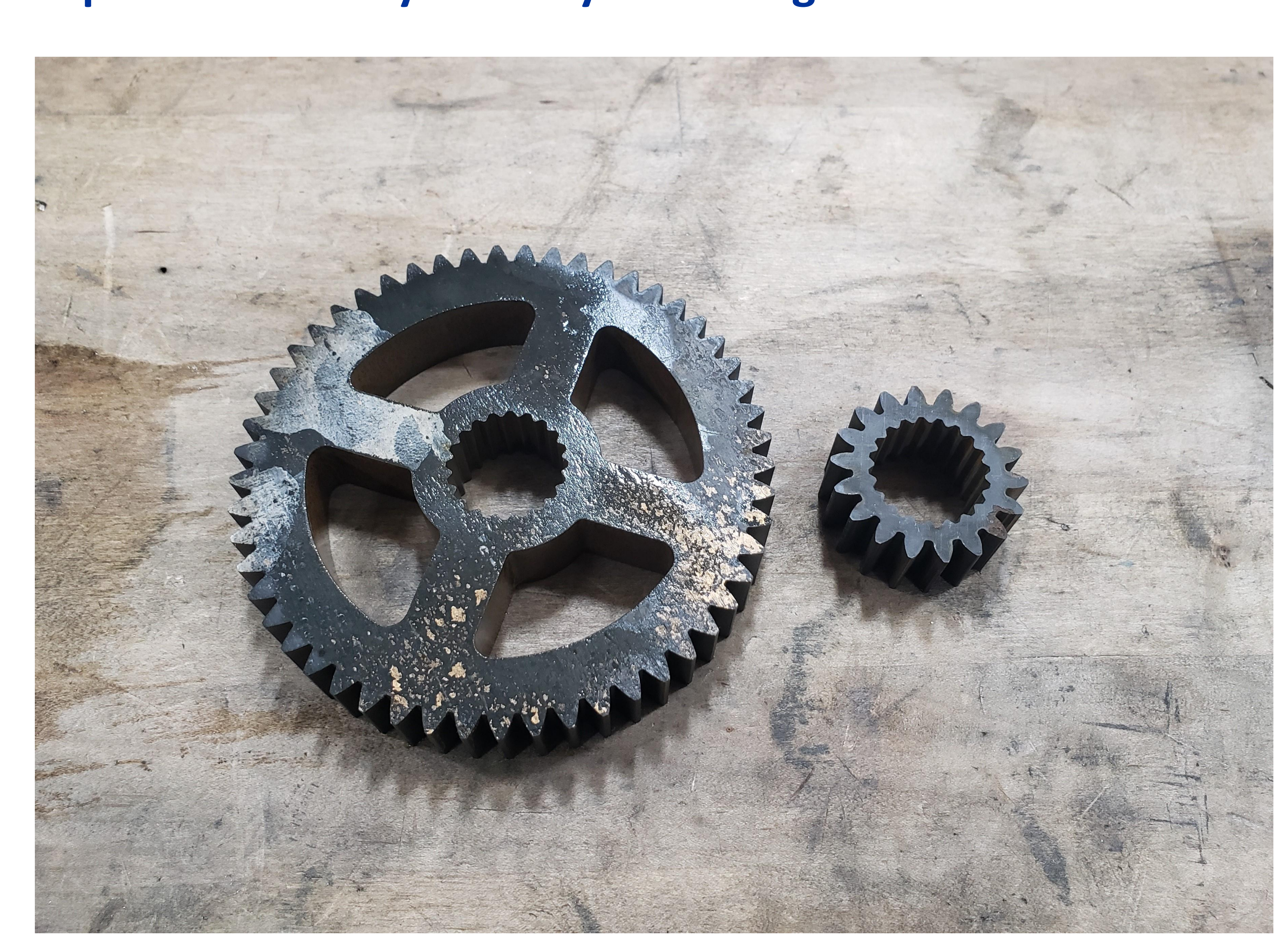
Gears made using wire EDM

Throughout my coursework at Cleveland State University, I have taken advantage of exceptional work experiences. From machining and metrology to machine design and prototype builds, I have worked within highly talented teams where my engineering aptitudes were avidly exercised. Three companies and nine semesters of co-op experience has exposed me to a wealth of engineering expertise including shop floor competence and intricate CAD have cultured work, manufacturing/assembly techniques along with proficiency in materials selection and component sourcing. I have become familiarized with creating and maintaining client relationships and on-site work for machine installations and service. As I prepare to graduate with an undergraduate degree in mechanical engineering, I consider myself well-equipped with a vast array of experience and trade savvy to enrich the respective industry with my knowledge.