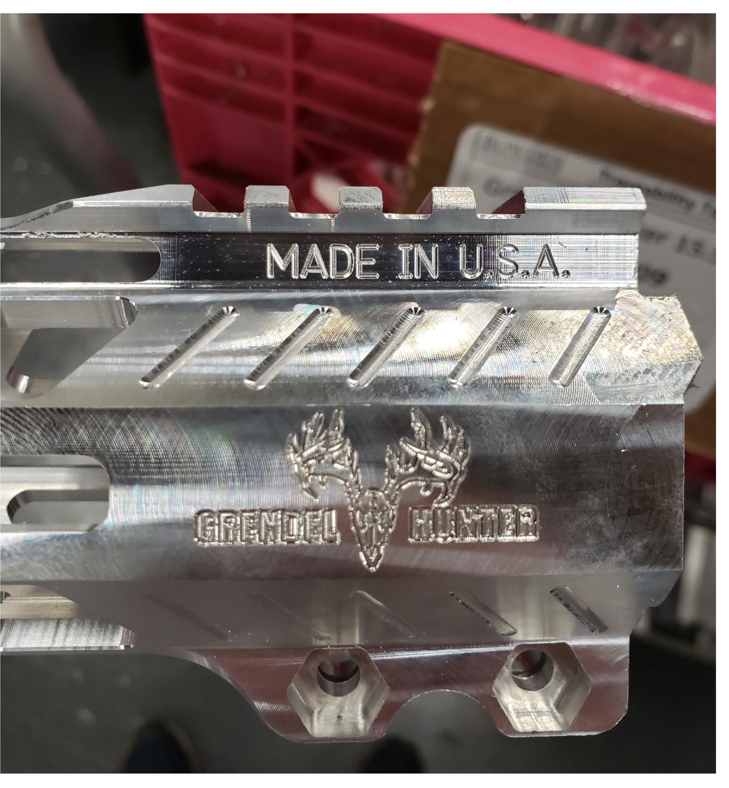
Aluminum part machined on Haas CNC mill

Computer numerical control adds repeatability and precision to machining that humans cannot mimic. Computer aided manufacturing softwares have allowed complex features to easily be created on milling machines with calculated toolpaths for incredible surface finishes and sustained tool life.