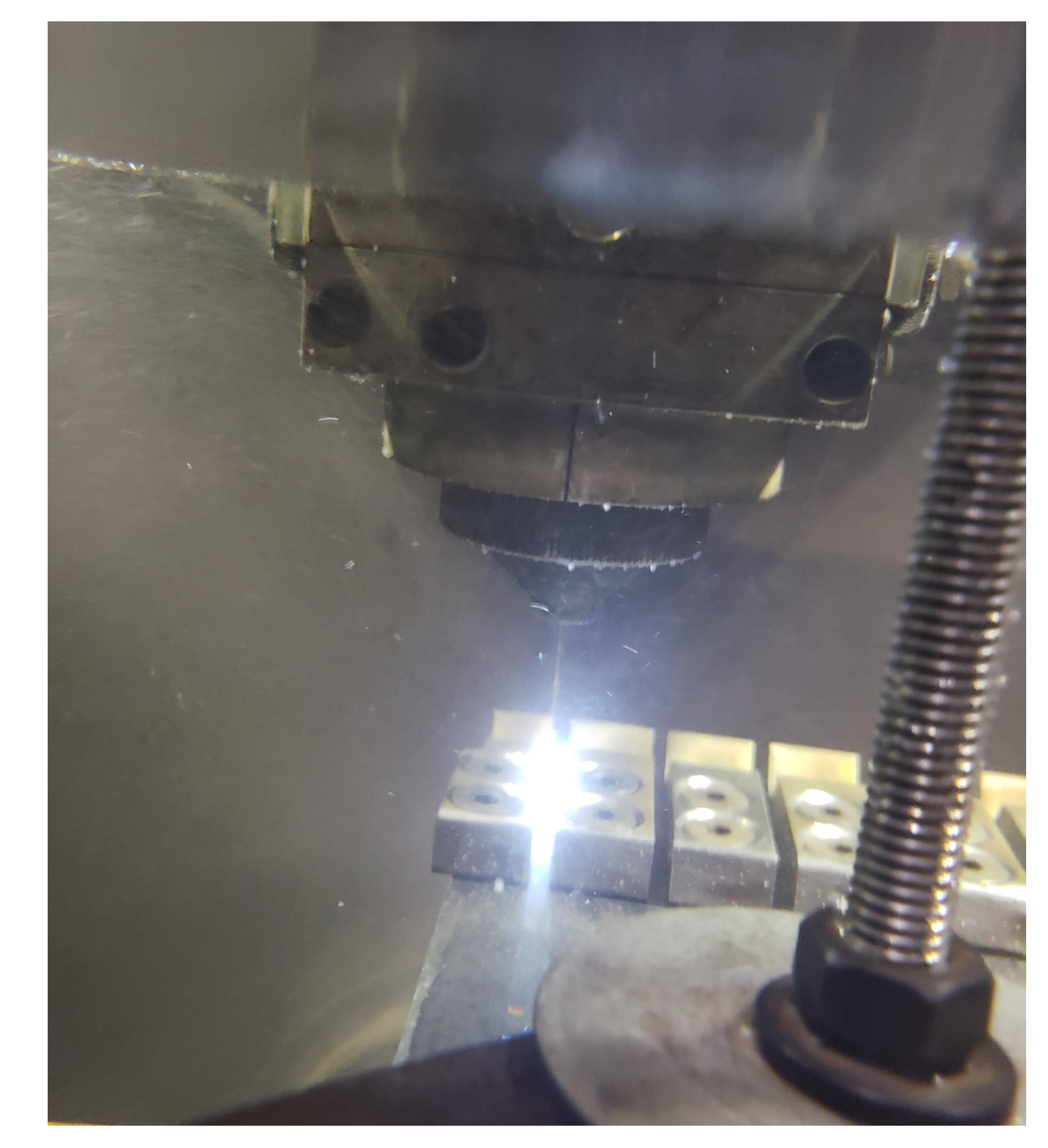
Submerged electrical discharge machining (EDM)

Wire EDM can be utilized to create extreme highprecision features on conductive materials. This process uses an electrically charged wire submerged in a tank of dielectric fluid to erode work material in a very controlled manner. Tolerances are known to be around one-hundred thousandth of an inch (0.00001). Since machining is based on conductivity, this process is useful on harder materials that are difficult to machine with other methods. This process is relatively time consuming, depending on work material, yet does not require an active operator and can be tended to intermittently.