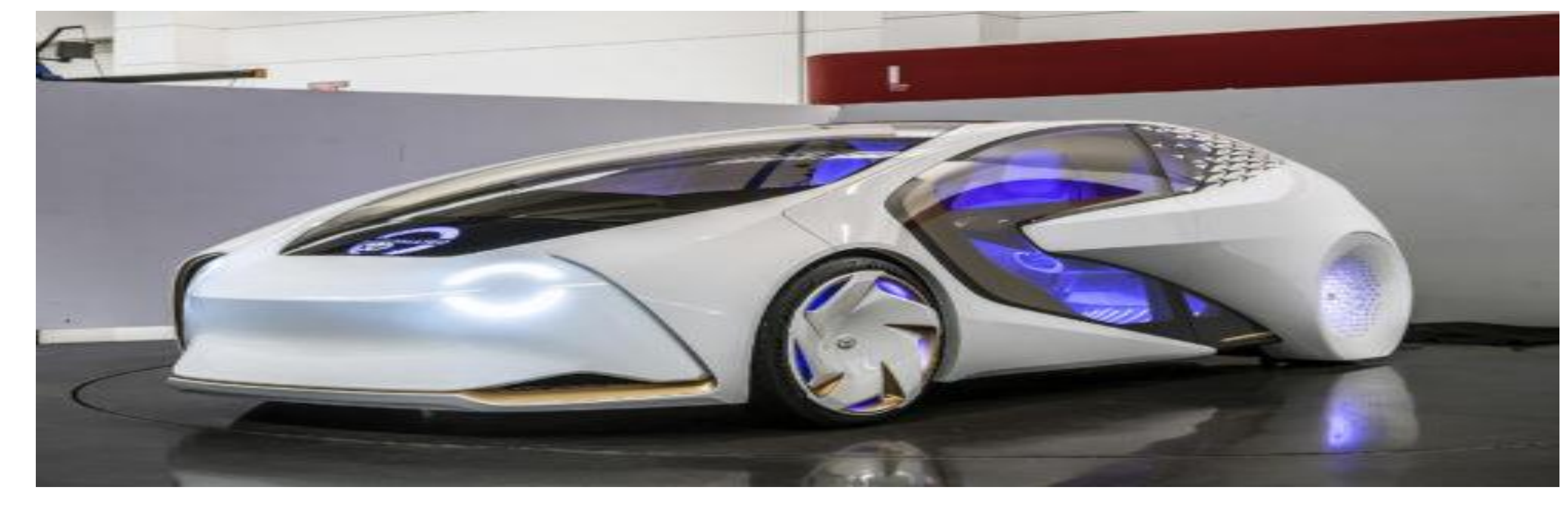
Figure 1. Futuristic Al Car From Toyota.