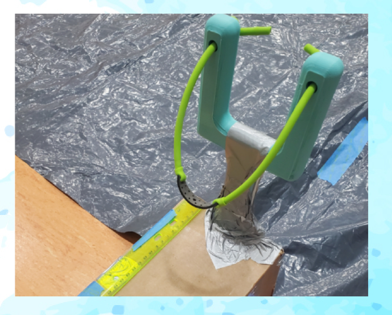
Figure 1. Setup of Slingshot and Base

Our main objective was to create the perfect slingshot by testing different elastic bands on different slingshots. To achieve this we had to come up with a couple different goals for this experiment. One goal we had was determining the perfect head shape. The other goal we had was determining the perfect band size, band shape, and the number of bands.