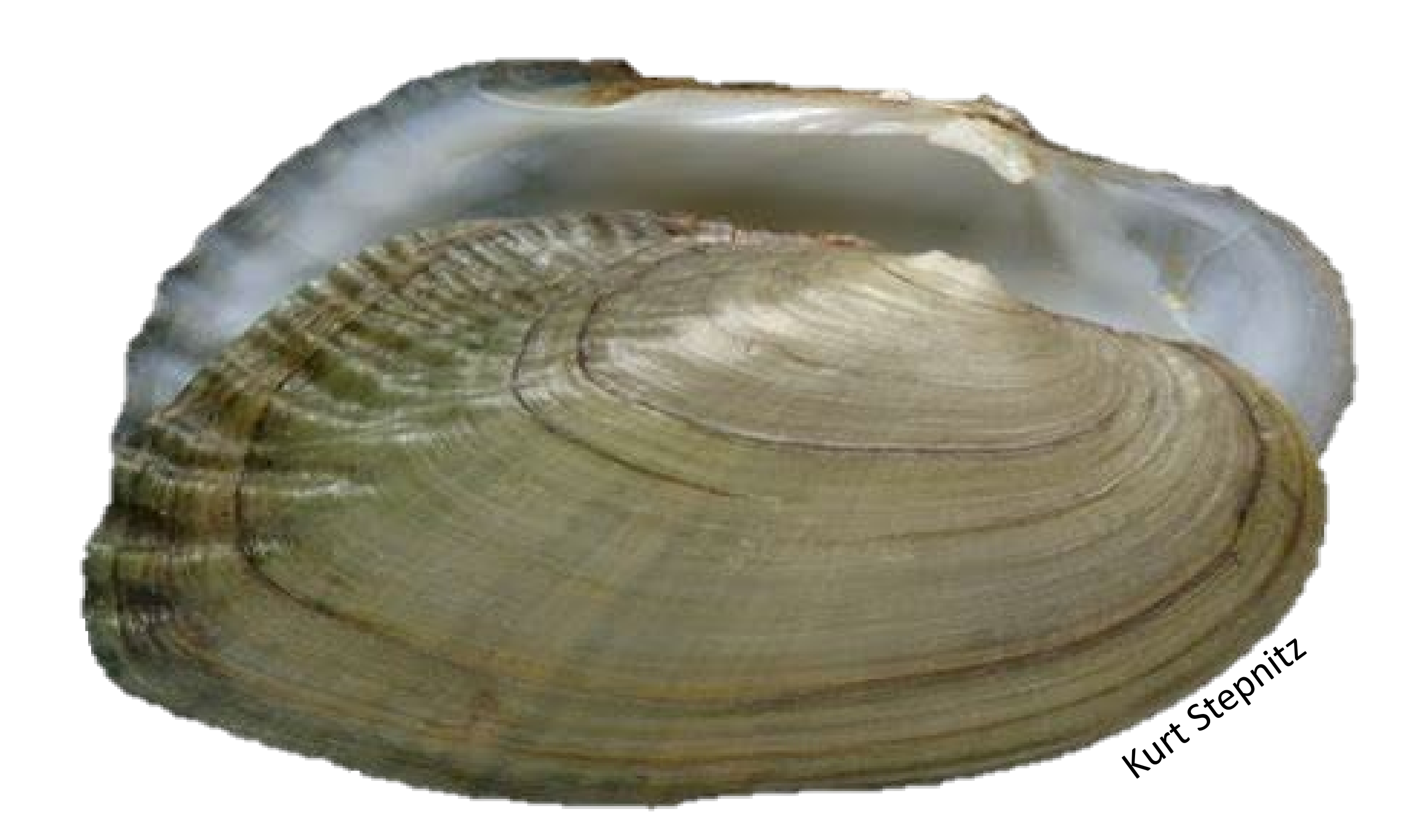
Figure 2. Example of a Lasmigona costata shell. Note the distinct ridges on the posterior slope.