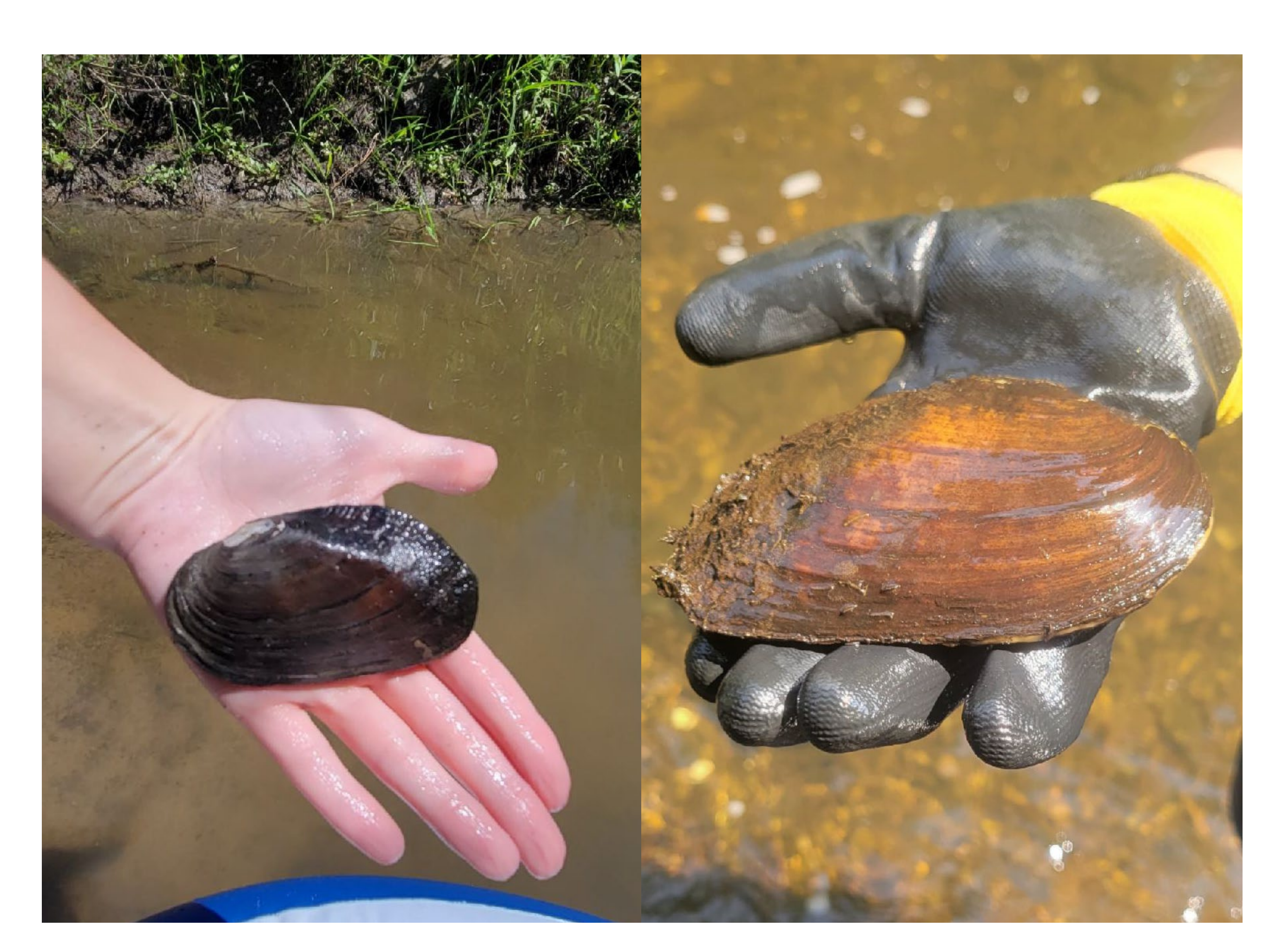
Figure 4. Two live Lasmigona costata mussels that I found during my research. The lines visible on the shells indicate annual growth.

We found a total of 1,018 mussels, with 768 being from the Tinkers Creek sites and 248 being from the Cuyahoga River sites. Out of the 1,018 mussels, 350 were Lasmigona costata , both live and shells. About 95% of the L. costata mussels were found in Tinkers Creek, and about 5% were found in the Cuyahoga River. We can observe a distinct pattern of L. costata having a prominent distribution in Tinkers Creek, but not in the Cuyahoga River.