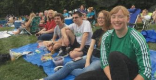
At Blossom Music Center

Eligibility: current undergraduate students who are US citizens and permanent residents. Underrepresented minorities and women are encouraged to apply.