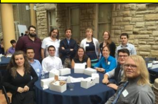
14 th Annual Northeast Ohio Undergraduate Research Symposium (CWRU; Aug 3, '17)

Projects: electron imaging of soft matter systems; design and characterization of protein-based materials; volume phase transition in polymer microgels; Janus particles; assembly of anisotropic nanoparticles; imaging of polymers on surfaces; microfluidic channels and mixers; optical study of cellular micro-sensation to fluid flow.