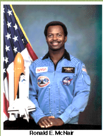
Ronald E. McNair