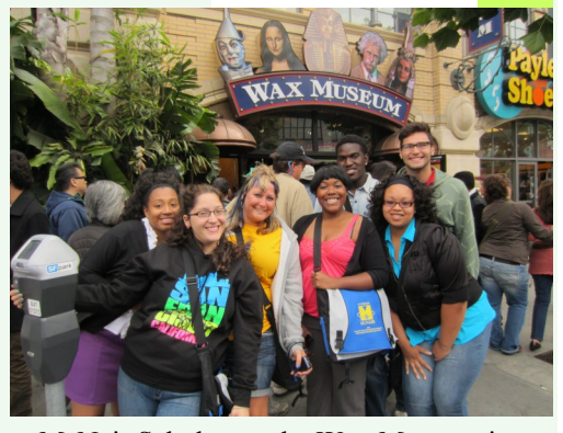
McNair Scholars at the Wax Museum in San Francisco