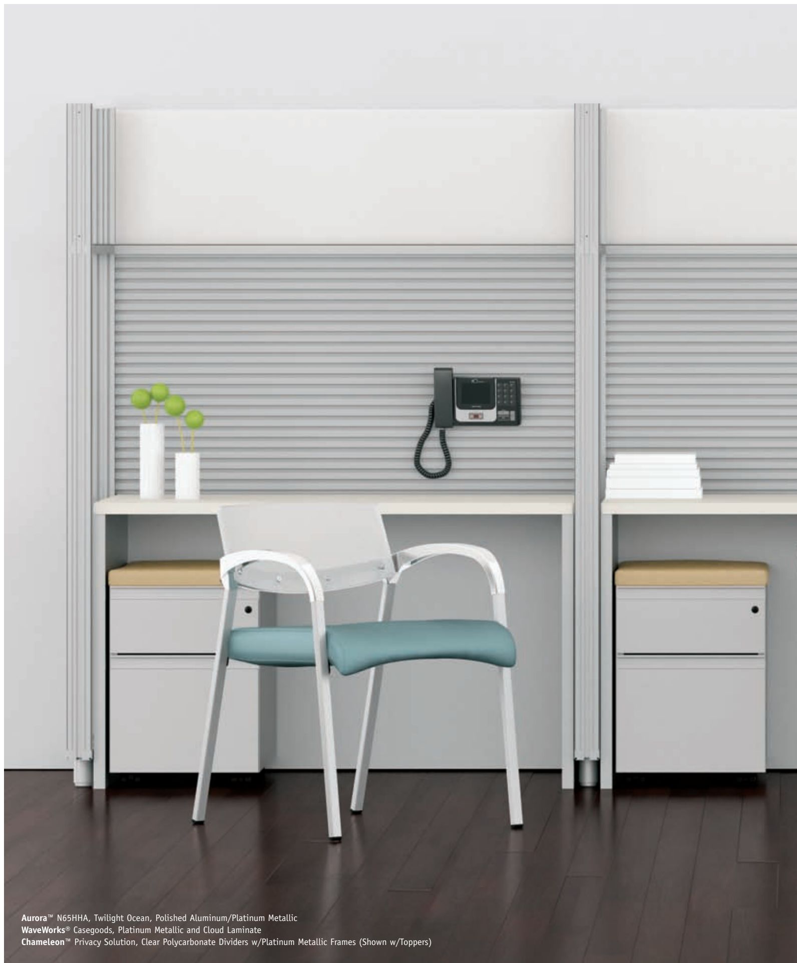
Aurora™ N65HHA, Twilight Ocean, Polished Aluminum/Platinum Metallic WaveWorks® Caseloads, Platinum Metallic and Cloud Laminate Chameleon™ Privacy Solution, Clear Polycarbonate Dividers w/Platinum Metallic Frames (Shown w/Toppers)