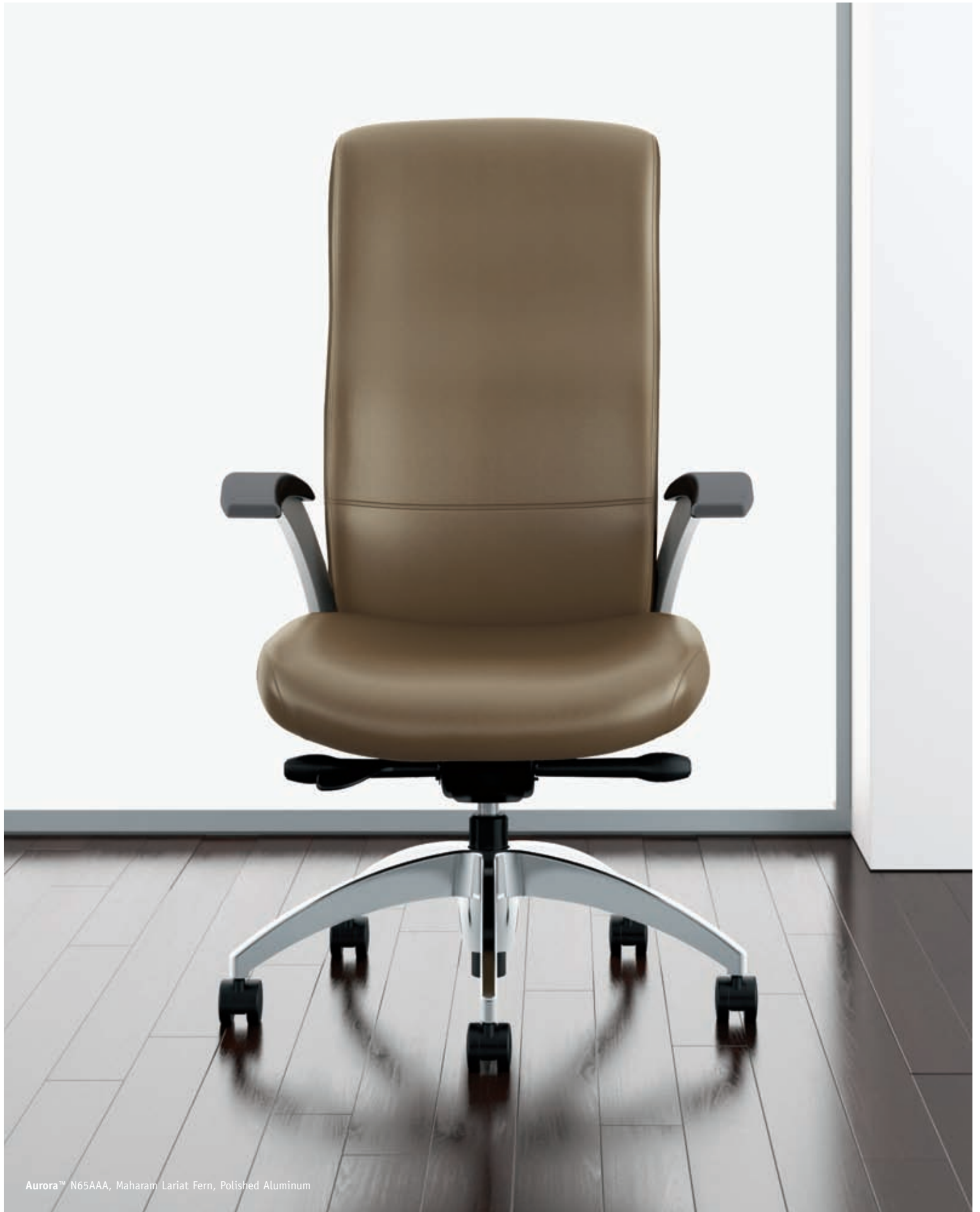
Aurora™ N65AAA, Maharam Lariat Fern, Polished Aluminum