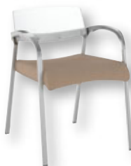
Guest Translucent Back D24" W23" H30"