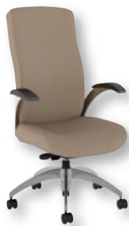
High Back D27" W27" H44"