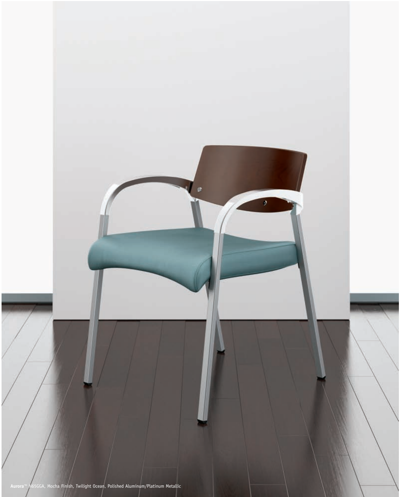
Aurora™ N65GGA, Mocha Finish, Twilight Ocean, Polished Aluminum/Platinum Metallic