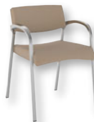
Guest Upholstered Back D24" W23" H30"

Desk Models Available in powder coated Platinum Metallic, Satin Nickel Metallic, Cinder or Polished Aluminum