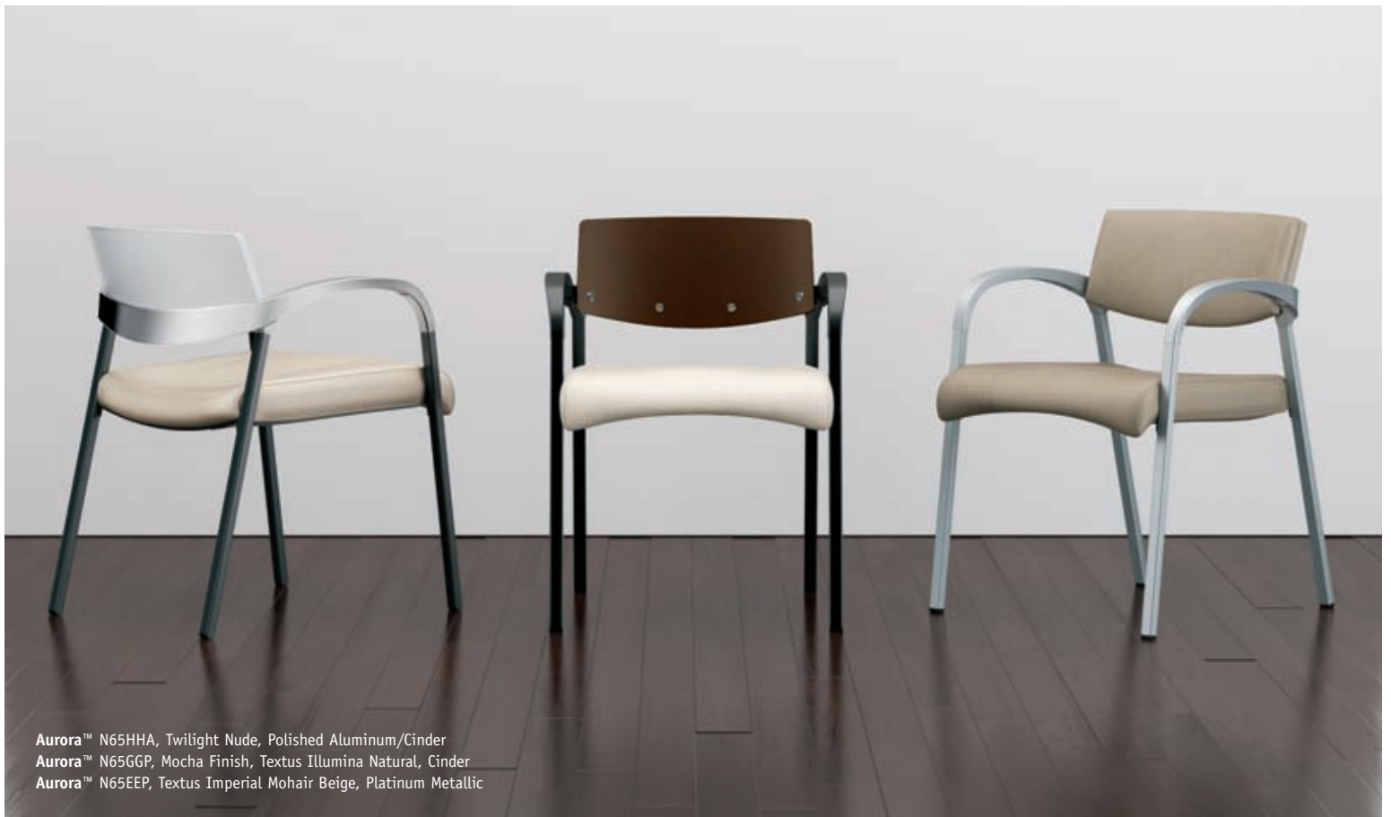
Aurora™ N65HHA, Twilight Nude, Polished Aluminum/Cinder Aurora™ N65GGP, Mocha Finish, Textus Illumina Natural, Cinder Aurora™ N65EEP, Textus Imperial Mohair Beige, Platinum Metallic