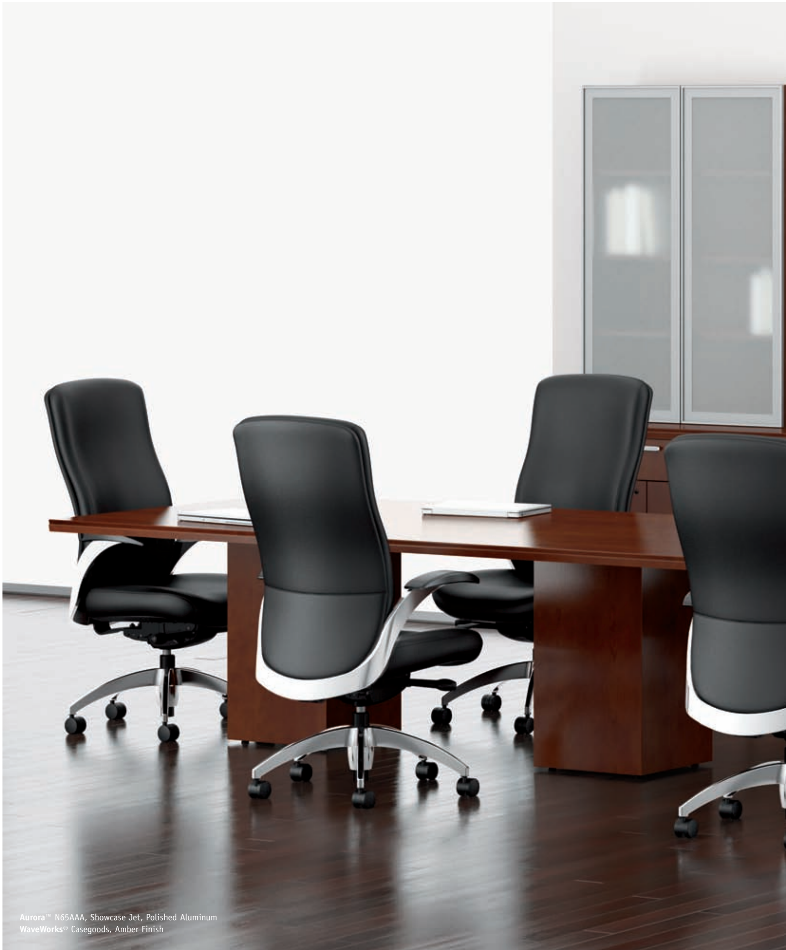
Aurora™ N65AAA, Showcase Jet, Polished Aluminum WaveWorks® Caseloads, Amber Finish