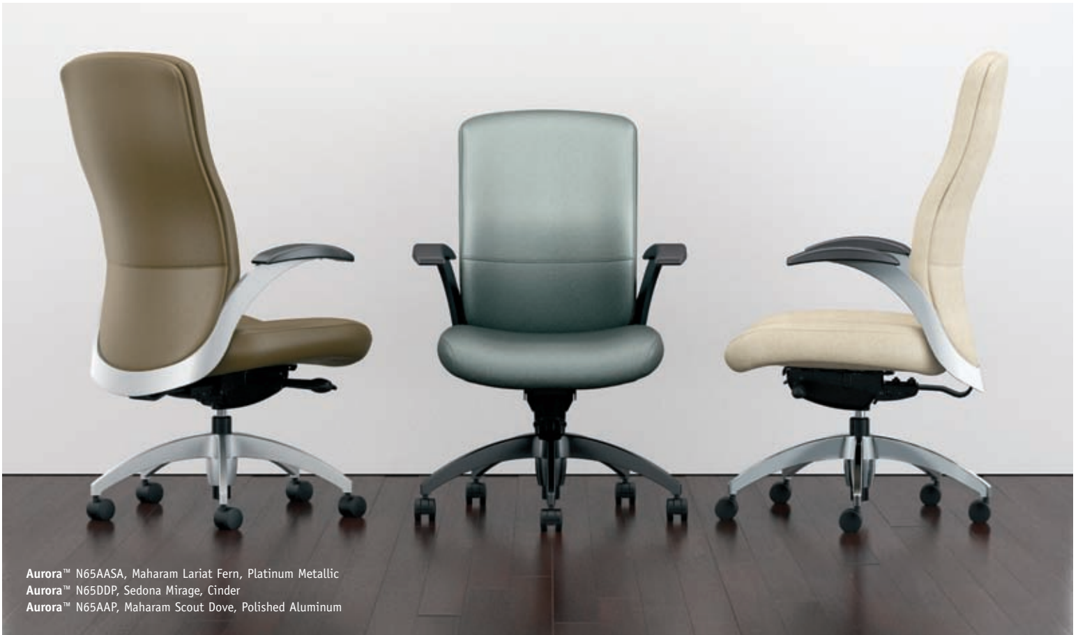
Aurora™ N65AASA, Maharam Lariat Fern, Platinum Metallic Aurora™ N65DDP, Sedona Mirage, Cinder Aurora™ N65AAP, Maharam Scout Dove, Polished Aluminum