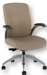
Mid Back D27" W27" H39"