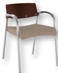
Guest Wood Back D24" W23" H30"