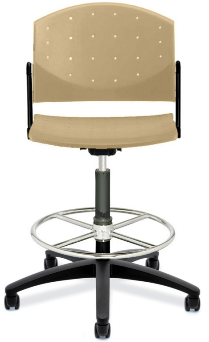
ED 4400-660 Medium Height Stool Option

Eddy's rugged construction and great versatility makes it suitable for use in high traffic areas such as dining areas, recreation rooms, training rooms, universities and colleges. Available in eight polypropylene colors on chrome or black frames, with optional seat and back upholstery pads. Eddy can be stacked in both four-legged and sled based versions – even with a writing tablet. Eddy's accessories and chair options allow them to be used in many different environments under varying conditions. Clever product design enables the user to modify the product as often as they like in their own environment. Eddy is simply in a class of it's own.