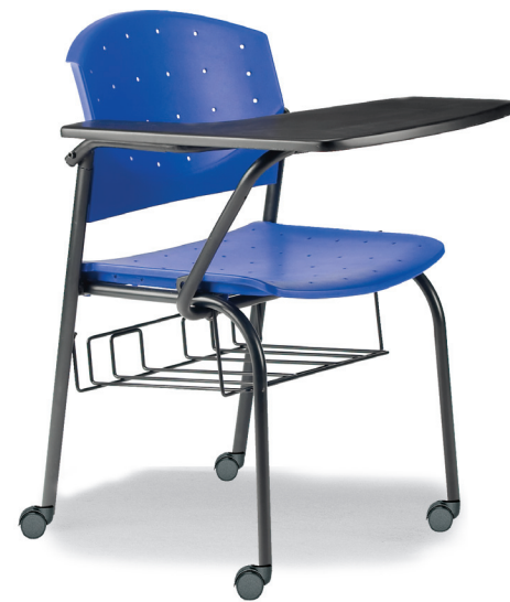
ED 4070 With optional large writing tablet and bookrack