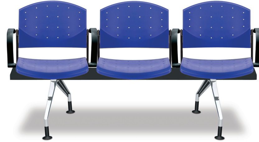
ED 4500B3S3 3 Beam with Arms