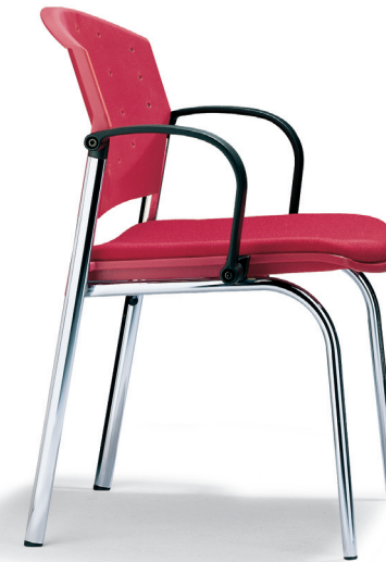
ED 4022-000 4-Post