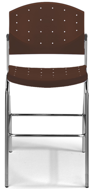
ED 4300-000 Bar Stool