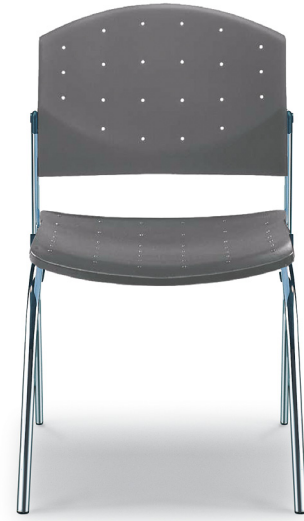
ED 4000-000 4-Post