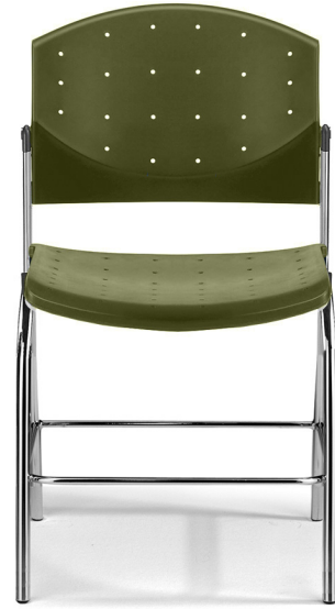
ED 4300-000CS Counter Stool