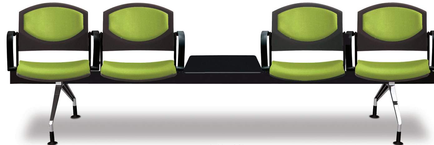
ED 4522B5S4C 5 Beam with Arms

Eddy offers a variety of models and optional add-on accessories such as writing tablets, casters, upholstery pads, ganging connectors, bookracks and more. From 4-post and swivel to stool, sled and beam seating, Eddy will fit a multitude of functions and can be customized with options to meet specific needs for any environment.