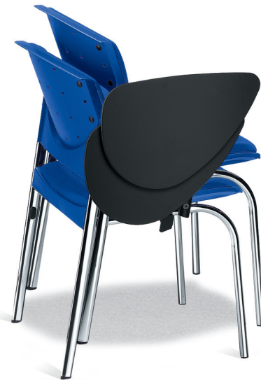
ED 4000 With optional small, stackable writing tablet