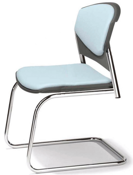
ED 4120-000 Sled