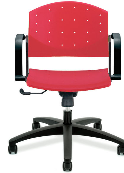
ED 4402 Swivel Tilt