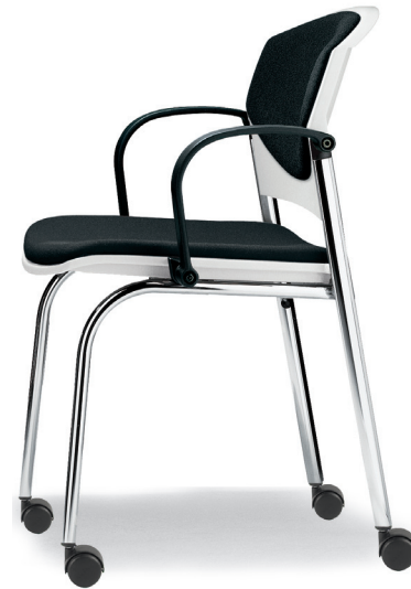
ED 4092-000 4-Post with Casters