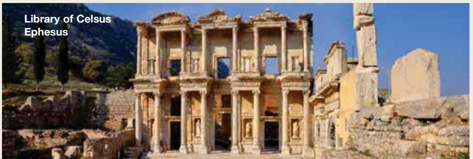
Library of Celsus Ephesus

CALL FOR ADDITIONAL INFORMATION 800.842.9023 OR 952.918.8950 FAX: 952.918.8975 • WWW.GONEXT.COM