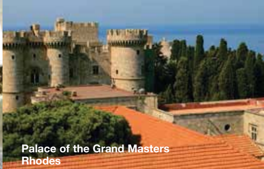
Palace of the Grand Masters Rhodes