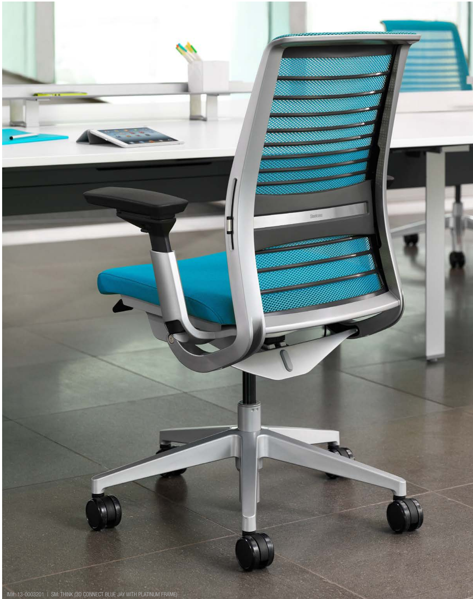
IM#: 13-0003201 | SM: THINK (3D CONNECT BLUE JAY WITH PLATINUM FRAME)