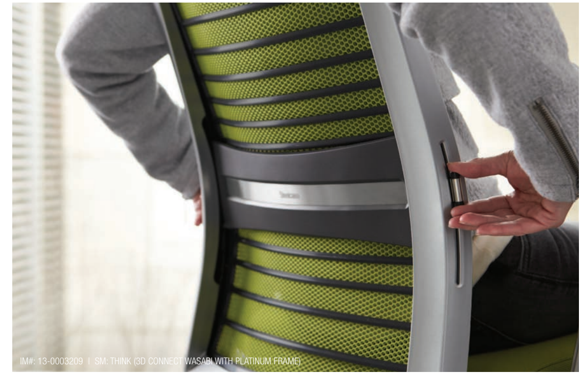
IM#: 13-0003209 | SM: THINK (3D CONNECT WASABI WITH PLATINUM FRAME)

Think easily creates maximum customized comfort with a minimal number of adjustments. The Integrated LiveBack System, combines a flexible back frame, linked flexors and dual-energy lumbar to intuitively sense and respond to user's needs.