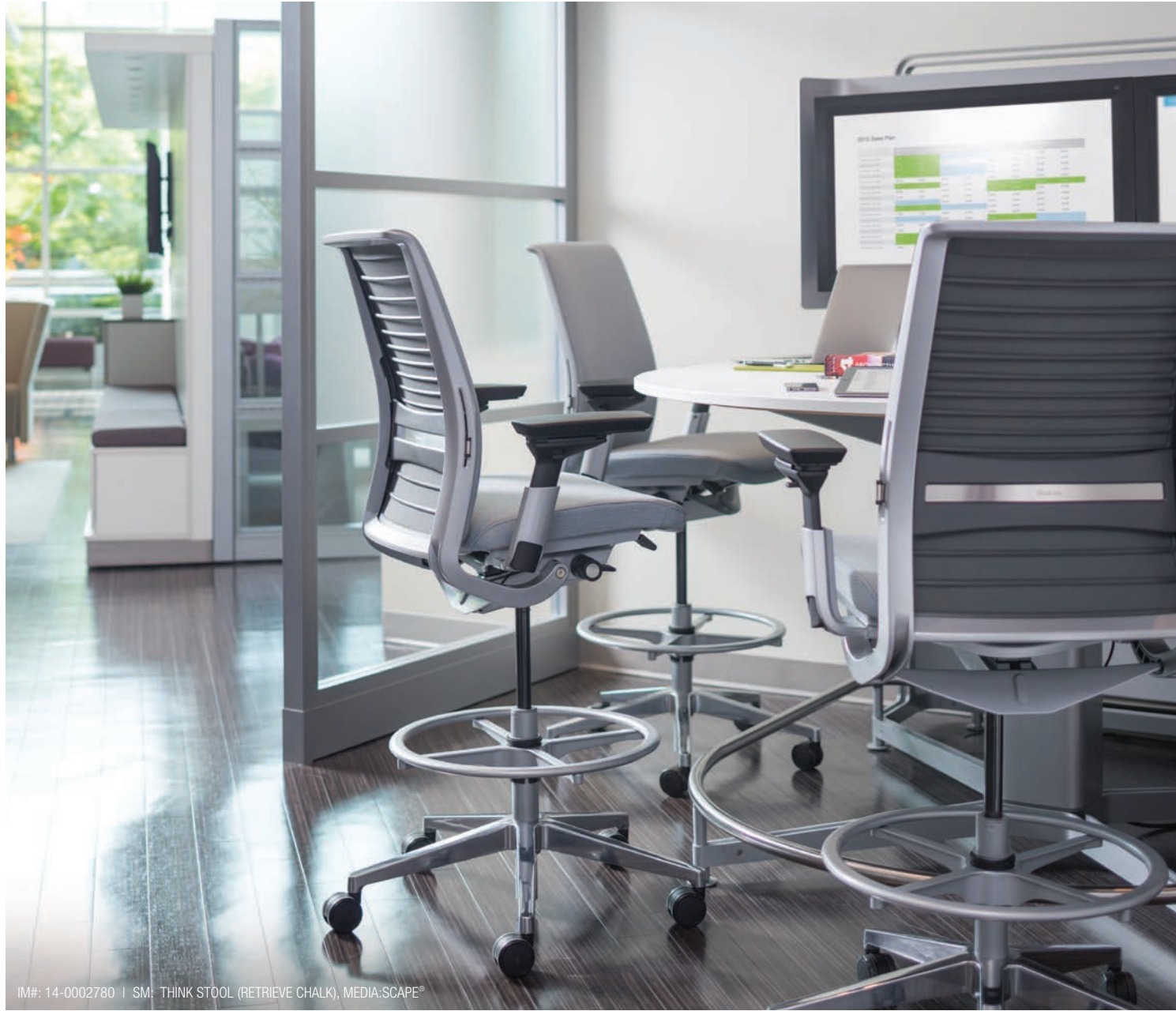
IM#: 14-0002780 | SM: THINK STOOL (RETRIEVE CHALK), MEDIA:SCAPE™