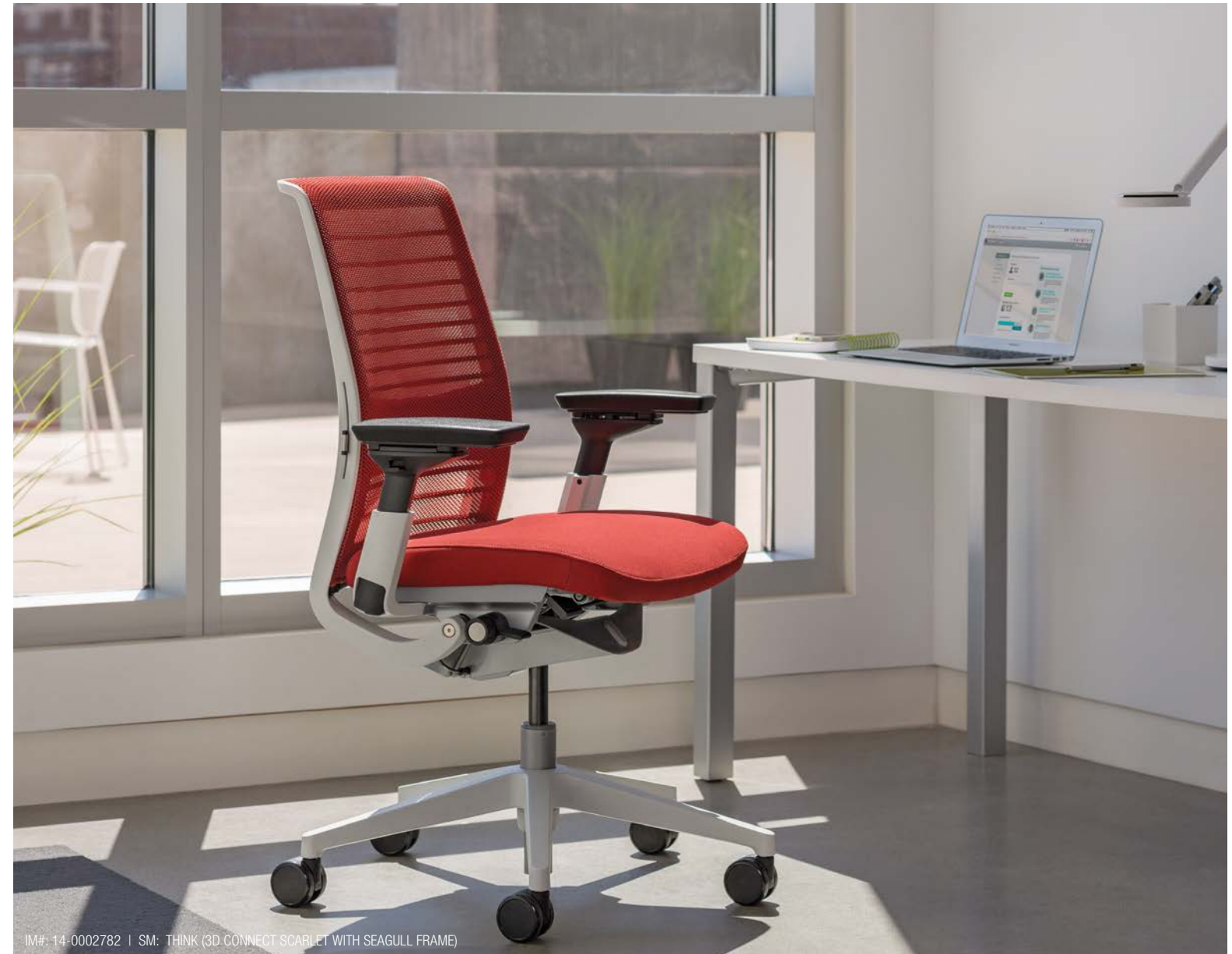
IM#: 14-0002782 | SM: THINK (3D CONNECT SCARLET WITH SEAGULL FRAME)

Think is smart enough to support both impromptu collaborative work, or an all day sit needed for focused work. It intuitively adjusts as a user moves, allowing them to get to work faster.