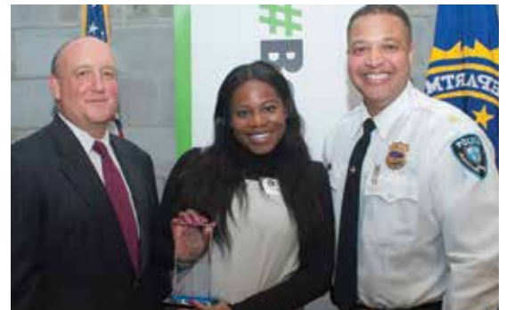
Cleveland State University's FBI Student Academy graduation ceremony during the Fall 2017 Semester.