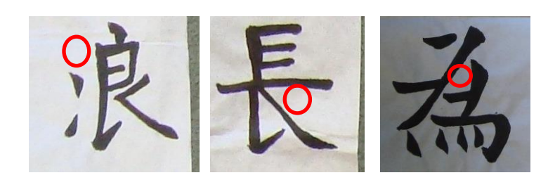
Figure 3 Characters with missing stokes

This problem is that students will often drop either part of a stroke, or a full stroke entirely, when forming a character (see Figure 3). This can happen for two main reasons. The first is that around half of the students have either not realized, or forgot, that a stroke was present in the original character. The other main reason is that another 40% of the students think that calligraphy is a purely creative task, so they should make each character unique to their own personal style, and thus will randomly shape or omit strokes or stroke parts. The best way to approach this problem is to teach the students about the various styles and scripts of calligraphy, as well as the meaning of the radicals and components. This will give the students a better idea of the importance behind each part of the character when it comes to writing, as well as the rules governing them.