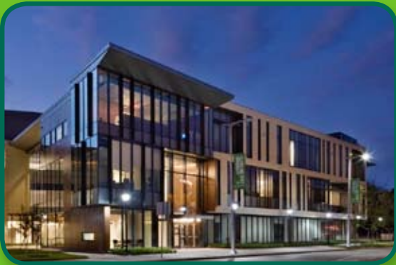
College of Education and Human Services