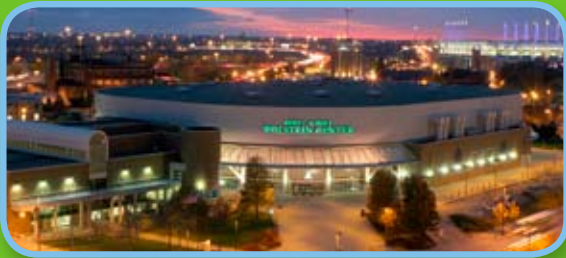
Bert L. and Iris S. Wolstein Center