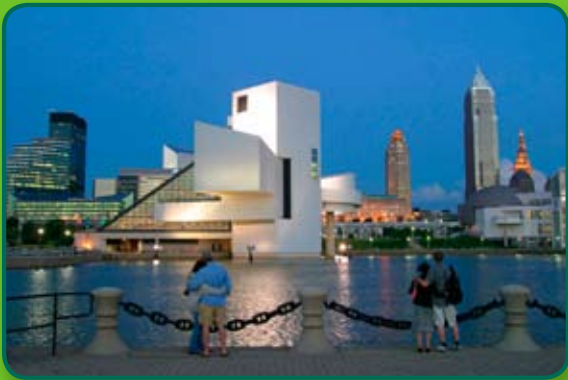
North Coast Harbor