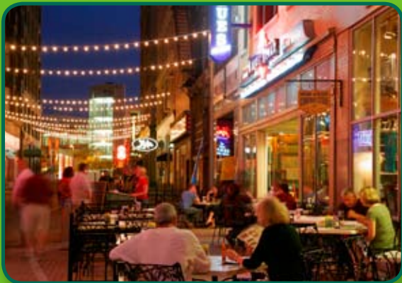
East 4th Street