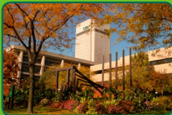
Science Research Center