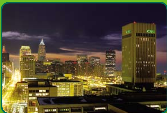
Rhodes Tower Cleveland State skyline

The downtown campus consists of 89 acres, with 45 buildings used for teaching, research, housing, administration, and recreation. Nineteen-story Rhodes Tower, containing the Michael Schwartz University Library, classrooms, and many faculty offices, is a striking feature on the Cleveland skyline. Cleveland State also has extended campuses in Westlake and Solon, Ohio. We feature a blend of old and new architectural styles, from historic Mather Mansion, Parker Hannifin Hall and Fenn Tower, to a new Recreation Center, Parker Hannifin Administration Center, Student Center, College of Education and Human Services in Julka Hall, and Euclid Commons apartment-style housing.