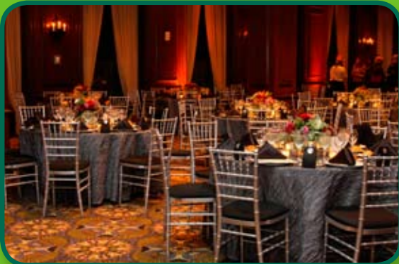
Fenn Tower – Panel Hall