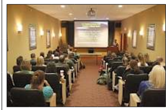
LEFT TO RIGHT: The College of Science 5th Anniversary was celebrated on September 16th by special lectures, receptions, and research presentations