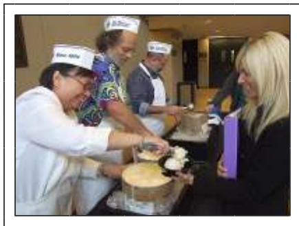
LEFT Department Chairs scoop ice cream at the Dean's List Ice Cream Social