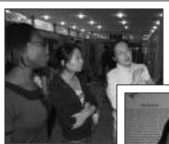
ABOVE, RIGHT Students present research at 2008 College of Science Research Day