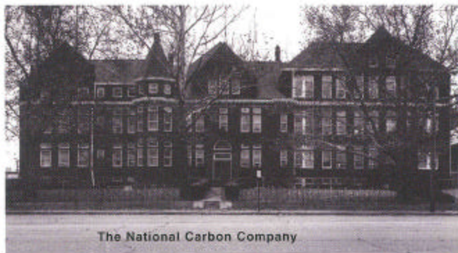
The National Carbon Company

very first battery intended for widespread consumer use: the sealed, six-inch, 1.5 volt Columbia dry cell. NCC was the first company to successfully manufacture and distribute sealed dry cell batteries on a large scale.