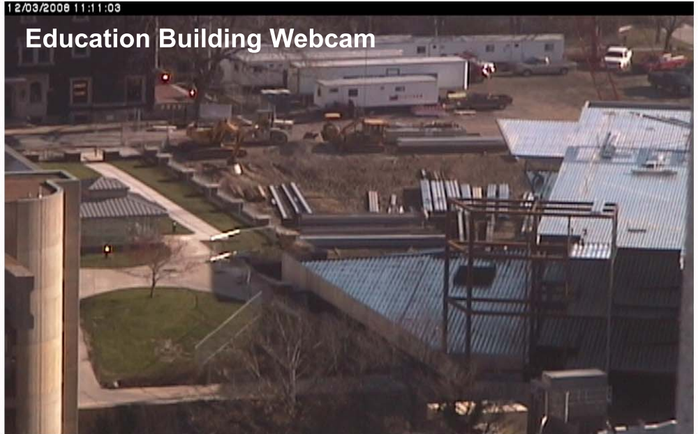
Education Building Webcam