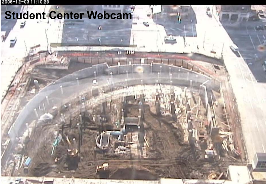
Student Center Webcam

Live images from our webcams are available 24/7 at: www.csuohio.edu/offices/architect