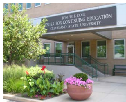
The ESL Program Office is located in the Cole Center for Continuing Education.