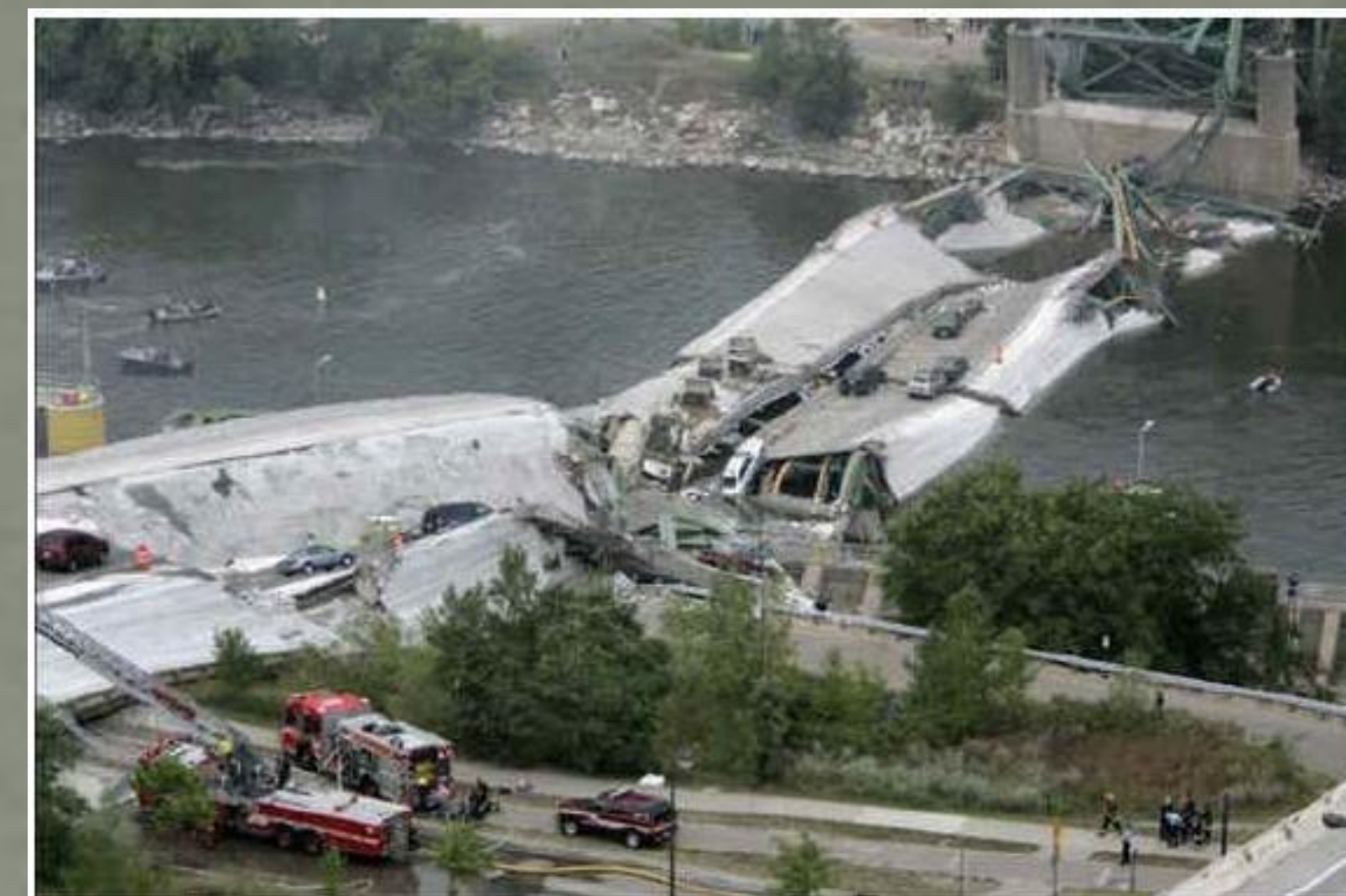
Fig. 1: The collapsed Minneapolis I-35W Bridge

The I-35W bridge was designed as a non-redundant structure, meaning that if any member fails, the entire bridge can collapse. Unfortunately the bridge collapsed in 2007 across the Mississippi River during rush hour as shown in figure 1. The bridge was about 40 years old. What fate does that leave for the almost 50 year old I-90 Inner Belt Bridge?